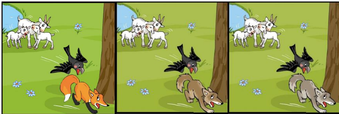
Figure 2. Picture 6, Baby Goats of the original MAIN stimuli (left), the proposes changes after considering cultural differences, desert wolf (middle) and grey wolf (right).