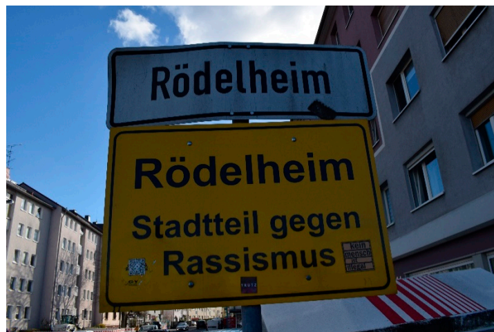
Figure 3. Neighborhood sign saying “Rödelheim—Neighborhood against racism”.

In the summer of 2015, a neighborhood-based volunteer network for refugee reception emerged before the city of Frankfurt opened the first accommodation center in Rödelheim. Today, “Welcome to Rödelheim” is a prize-winning network of about 40 active and 60 passive members that organize help and social and cultural activities for refugees in the neighborhood. This includes German classes, homework tutoring, lending and repairing bicycles, excursions into the city and its surrounding, individual support with paperwork and administrative authorities, as well as joint leisure activities, like cooking and gardening. Through these neighborhood activities, the welcome initiative provides contact opportunities for what they call “old” and “new” Rödelheim-residents, and it strives to create a welcoming environment in the neighborhood. As the initiative states on its website, it aims to “make a contribution to a successful arrival in the neighborhood” and to support refugees “in order to facilitate their arrival in Rödelheim’s neighborhood society” ( Willkommen in Rödelheim 2019 ).