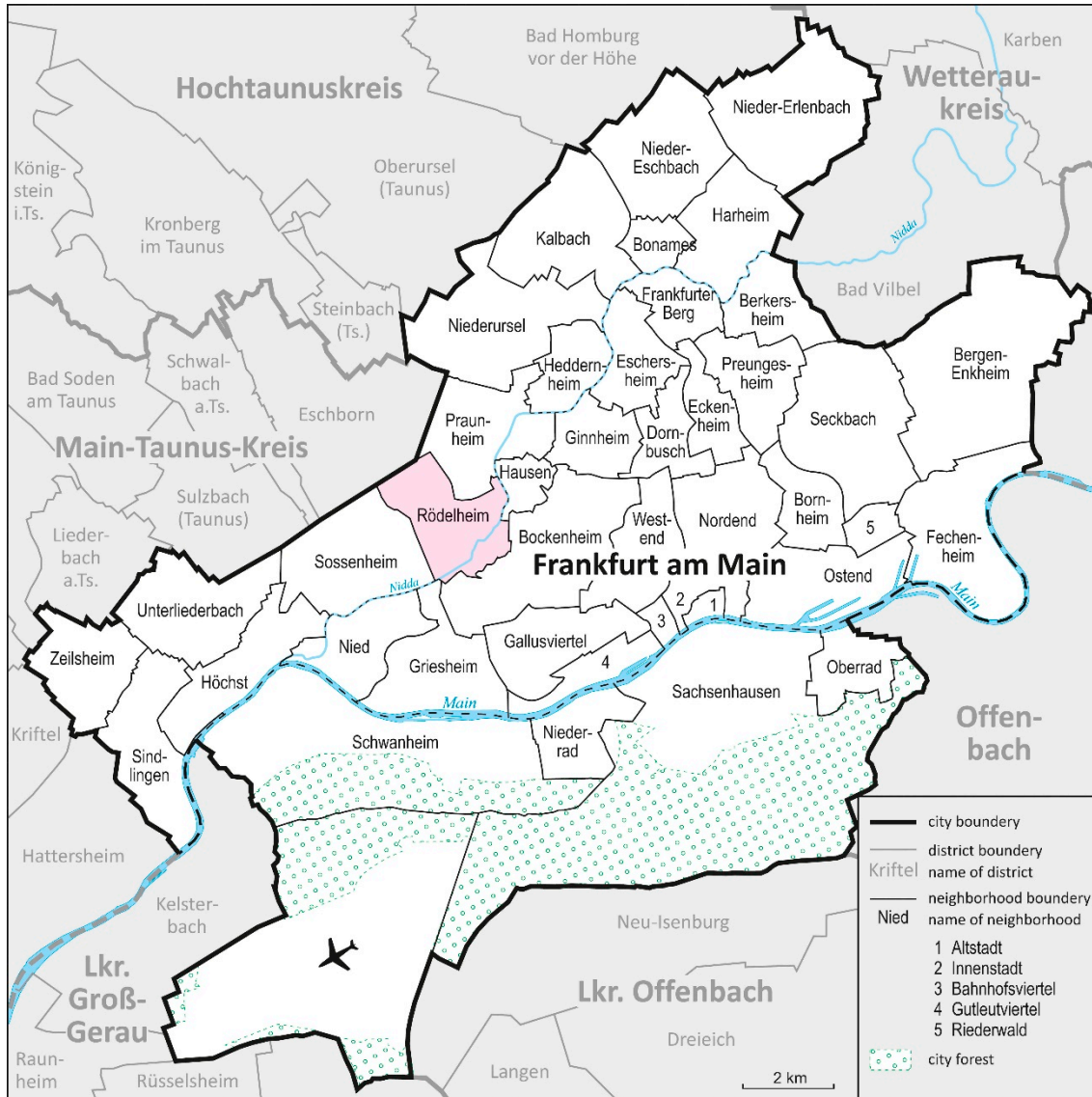
Figure 2. Map of the location of Rödelheim within Frankfurt (created by Department of Human Geography, Goethe-University Frankfurt, data provided by Stadt Frankfurt am Main 2019).

slightly exceeds Frankfurt’s average of residents with some kind of migration history. The neighborhood has a vital civil society landscape and it hosts many cultural activities. As part of the “Frankfurt Active Neighborhood”-program, Rödelheim’s western district has a neighborhood office that is run by a district manager from a Christian welfare organization and funded by the city of Frankfurt. If you enter Rödelheim by one of the bigger access roads, you will be welcomed to “Rödelheim—Neighborhood against racism” (Figure 3).