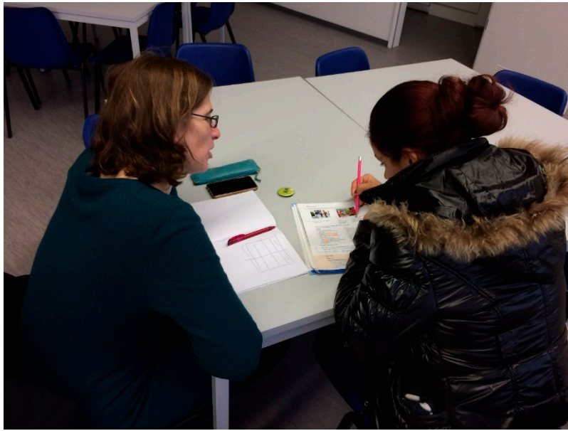
Figure 1. The author volunteering with homework tutoring.