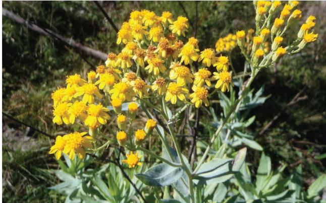
Fig 11. Senecio linearifolius var. dangarensis flowering in Goulburn River National Park, October 2015.

both the Mt Dangar and Wollemi sites considerably. Senecio linearifolius var. dangarensis is listed as Endangered on the BC Act 2016 . An EOO of 21 km 2 and an AOO of 16 km 2 ( n = 75 ) have been calculated for this taxon, using a cleaned dataset incorporating AVH, Bionet Atlas and undatabased records collected as part of current research on this species.