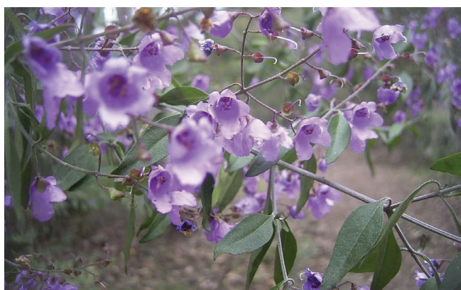
Fig 9. Prostanthera cineolifera flowering in Pokolbin State Forest, October 2010.