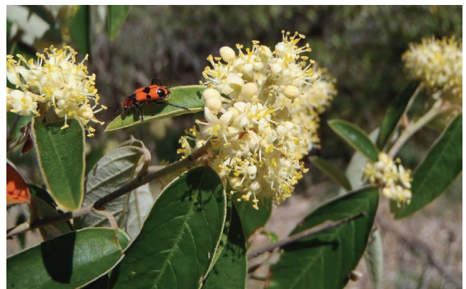
Fig 8. Pomaderris queenslandica flowering near north-western Wollemi, September 2015.