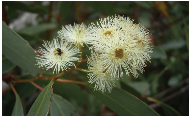
Fig 5. Eucalyptus fracta flowering on the Broken Back Range, December 2004.