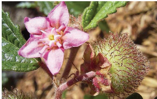
Fig 2. Commersonia rosea flowering and fruiting in northern Wollemi, October 2014.

12,486 km 2 and an AOO of 400 km 2 ( n = 224 ) have been calculated for this taxon within the Hunter catchment, although this species also occurs extensively elsewhere in New South Wales, Queensland, the Northern Territory and Western Australia.