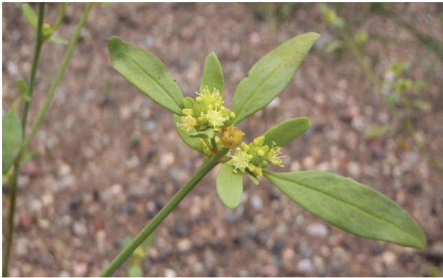
Fig 7. Monotaxis macrophylla flowering and fruiting in northern Wollemi, October 2014.

Howell, Glen Innes, Torrington, Bega and Moruya (Halford & Henderson 2002b; AVH records). Mass germination after fire has been reported for this species in many other locations, such as in South East Forests National Park near Bega (NSW 989541, J. Miles, December 2014) and on the Northern Tablelands (NE 68038, J.B. Williams, November 1998). Monotaxis macrophylla is listed as Endangered on the BC Act 2016 . An EOO of 910,682 km 2 and an AOO of 396 km 2 ( n = 149 ) have been calculated for this taxon.