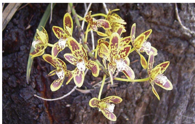
Fig 3. Cymbidium canaliculatum flowering near northern Wollemi, November 2008.