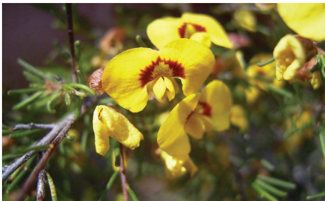
Fig 4. Dillwynia tenuifolia flowering in western Sydney, November 2004.

Collections of a small ironbark made along the Glen Gallic Trail of northern Wollemi in 2012 were determined initially as Eucalyptus fracta (Fig. 5), although there remains some uncertainty with this identification. Eucalyptus fracta principally occurs at the eastern end of the Broken Back Range near Pokolbin (Hill 1997; Copeland & Hunter 2005), some 65 km to the south-east of Glen Gallic. In the field the small stature, bare upper branches and fruit morphology were sufficiently consistent with known populations of Eucalyptus fracta along the Broken Back Range to support the initial diagnosis, but since that time there has been no advancement in identity. This collection (NSW 984037, S.A.J. Bell, June 2012) is currently housed in AVH as an indeterminate Eucalyptus taxon, and re-inspection of this population is warranted. The nearest confirmed collection of Eucalyptus fracta lies c. 40 km to the south-east of Glen Gallic (and approximately mid-way to the Broken Back Range population), along the northern escarpment of Yengo National Park near Milbrodale (NSW 862264, S.A.J. Bell, June 2006), suggesting that outliers such as at Glen Gallic are not unusual. Until such time that the Glen Gallic population can be re-assessed, Eucalyptus fracta (listed as Vulnerable on the BC Act 2016 ) is here considered a tentative addition to the Wollemi flora. An EOO of 176 km 2 and an AOO of 44 km 2 ( n = 35 ) have been calculated for this taxon.