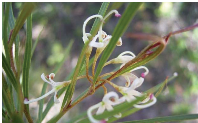
Fig 6. Grevillea parviflora subsp. parviflora flowering on the Central Coast, December 2003.