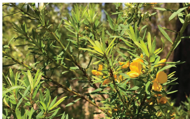
Fig 10. Pultenaea 'monticola' Mt Irvine, flowering in Blue Mountains National Park near Mt Irvine December 2018.