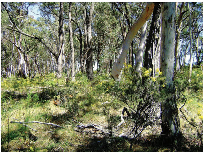
Figure 3. Carcalgong - Southern Tablelands Dry Sclerophyll Forest habitat with dominant trees of Eucalyptus rossii , Eucalyptus sparsifolia and Eucalyptus lactea . Note dominance of Acacia meiantha in the shrub layer.

The subpopulations at Carcalgong and Mullions Range SF occur in the same broad Southern Tablelands Dry Sclerophyll Forests vegetation class, however both dominant and substrata composition differ. At Carcalgong the dominant trees along the ridgelines are Eucalyptus rossii , Eucalyptus sparsifolia and Eucalyptus lactea [syn. Eucalyptus praecox ] together with scattered Eucalyptus goniocalyx (Fig. 3). Dominants at Mullions Range SF include Eucalyptus rossii , Eucalyptus mannifera , Eucalyptus dives and Eucalyptus macrorhyncha (Tindale et al. 1992; Priday 2017) (Fig. 4). Within this broad classification, Priday (2017) mapped six communities in Mullions Range SF, based mainly on the presence or absence of Eucalyptus rossii and/or Eucalyptus goniocalyx , together with four riparian communities. Among these various communities reside subdominants of Eucalyptus goniocalyx , Eucalyptus rubida subsp. rubida , Eucalyptus robertsonii subsp. hemispherica , Eucalyptus sparsifolia and Eucalyptus viminalis (the author considers Eucalyptus radiata subsp. radiata shown on some Mullion Range maps (Priday 2017) was a misidentification of Eucalyptus robertsonii subsp. hemispherica , and Eucalyptus dalrympleana subsp. dalrympleana a misidentification of Eucalyptus viminalis ).