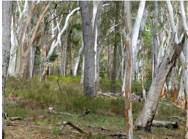
Figure 4. Mullions Range State Forest - Southern Tablelands Dry Sclerophyll Forest habitat with dominant trees of Eucalyptus rossii , Eucalyptus mannifera , Eucalyptus dives and Eucalyptus macrorhyncha . Note wilding Pinus radiata invasion.

Of the 10 communities in the Mullions Range SF mapped by Priday (2017), over 90% of the Acacia meiantha colonies showed a strong association with the single open forest community characterised by Eucalyptus rossii , Eucalyptus macrorhyncha , Eucalyptus dives and Eucalyptus mannifera subsp. mannifera . Within this community, Priday (2017) found Acacia meiantha in a range of topographic positions, aspects and soil depths, although apparently not in riparian communities. Contrary to Tindale et al. (1992), Priday (2017) reports Acacia meiantha also occurs among rocky outcrops.