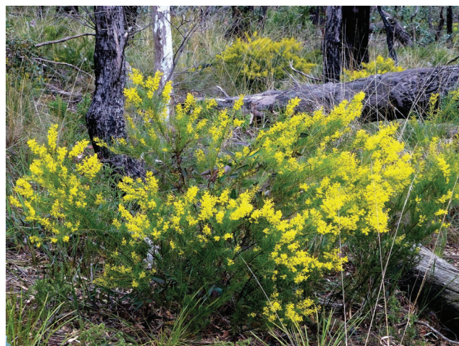
Figure 6. Multi-stemmed habit of Acacia meiantha due to suckering from the roots of a single parent plant, forming a cluster of ramets (Mullions Range State Forest).