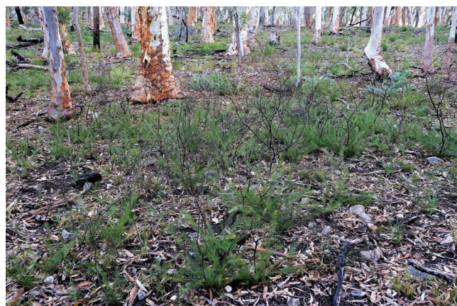
Figure 7. Sucker regeneration of Acacia meiantha following cool hazard reduction burn (Mullions Range State Forest).