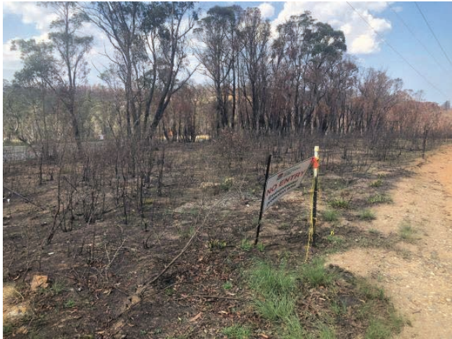
Figure 8. Clarence - Upper Blue Mountains Narrow-leaved Peppermint - Silvertop Ash - Mountain Grey Gum ( Eucalyptus radiata , E. sieberi ) shrubby open forest habitat with Acacia meiantha burnt in wildfire December 2019. Plants were resprouting in August 2020 (D Benson pers. comm.).