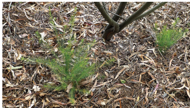
Figure 5. Suckering ramets around the base of a parent plant of Acacia meiantha .

in and around all three locations, especially in the Mullions Range SF.