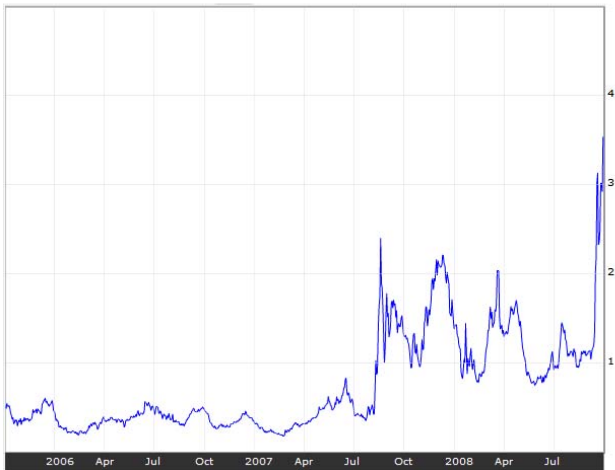
Figure 1: Spread between 3-month LIBOR and 3-month Treasury bills (TED spread, in percent) over the last 36 months (3Q 2005 – 3Q 2008)

And then there is the indirect channel of contagion, following from the dramatic rise in CDS spreads and lending rates in the interbank market where lending rates reached record levels for an extended period, and markets became shallow. For some institutions, like Bear Stearns and Northern Rock in March 2008 and Lehman Brothers in September 2008, interbank lending became virtually impossible, experiencing a run on its reserves 1 at the same time. While Northern Rock was bailed out and Bear Stearns was taken over by JP Morgan Chase subsidized by the government, Lehman Brothers went bankrupt. This indirect channel mainly affected institutions with strong reliance on interbank lending, investment banks in particular. Extremely high levels of LIBOR over risk-free rates (see Figure 1) and an unprecedented small supply of funds in the interbank market forced banks to boost their liquidity reserves. The write-downs of their asset portfolios diminished the banks' equity capital and forced them to raise capital from investors, including Sovereign Wealth Funds.