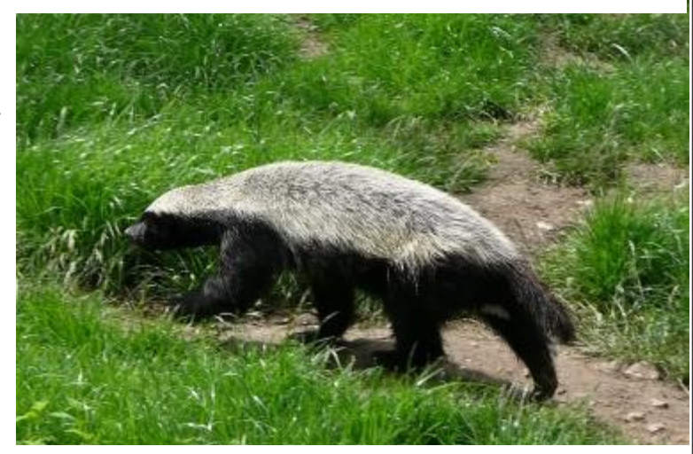
Honey Badger Mellivora capensis in Howletts Wild Animal Park, Kent, England