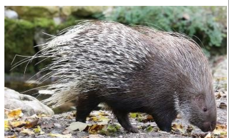
Indian Crested Porcupine Hystrix indicus