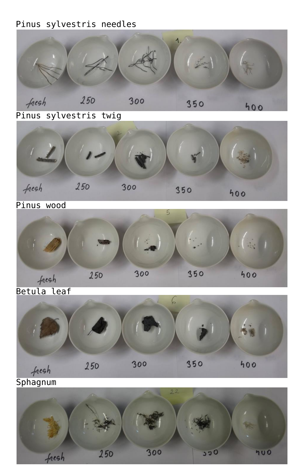
Fig. S1 Selected photographs of pre and after burning plant material from Siberia in a muffle oven at 250, 300, 350, 400 and 450 °C. Note that some of plant material turned to ash at lower temperature than others.