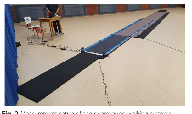
Fig. 2 Measurement setup of the overground walking systems Zebris, OptoGait and GAITrite

Zebris (2 m), as well as two mats (each of 2 m length) positioned on both ends of the walkway with the same height as GAITrite, to consider gait initiation and gait termination on an even surface. The walkway (between OptoGait bars) was limited to a width of 0.6 m, corresponding to the width of the Zebris system. Upon arrival in the gym of the Institute of Sports Sciences at the University of Hamburg, where the study was conducted, the participants were informed about the content of the study and signed a declaration of consent. Afterwards the height, weight, leg length (left and right) and shoe size were measured. Then the acceleration sensors were attached (see Fig. 1). Waiting at the starting position the test person was instructed and the walking conditions were described.