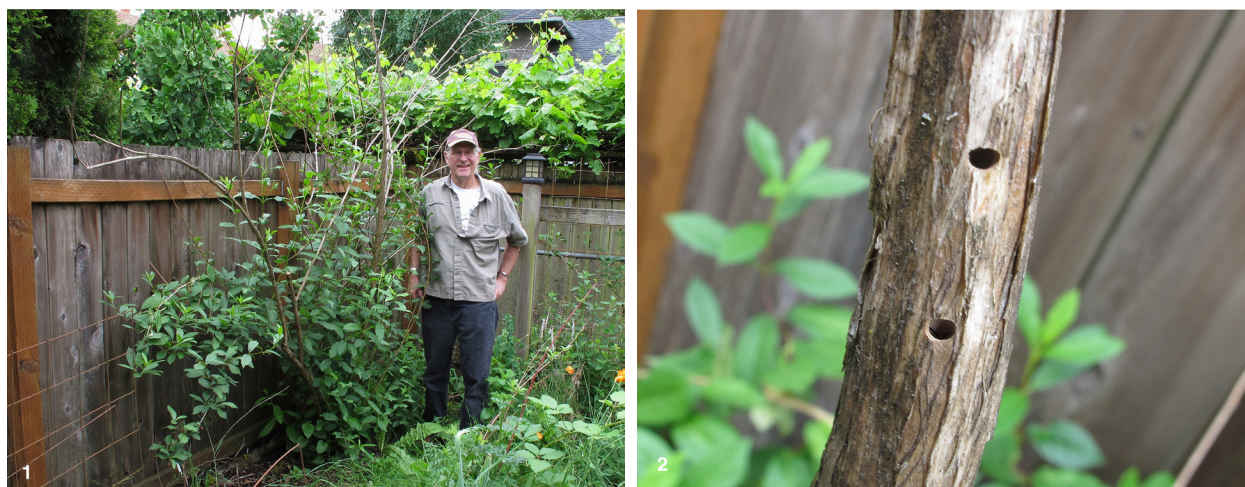
Figures 1–2. Agrilus cyanescens host plant. 1) Lonicera involucrata , the larval host plant where Agrilus cyanescens was found in Portland, Oregon. Alan Mudge. 2) Adult Agrilus cyanescens exit holes in branch of host plant.

Received July 31, 2019; accepted August 14, 2019. Review editor Oliver Keller.