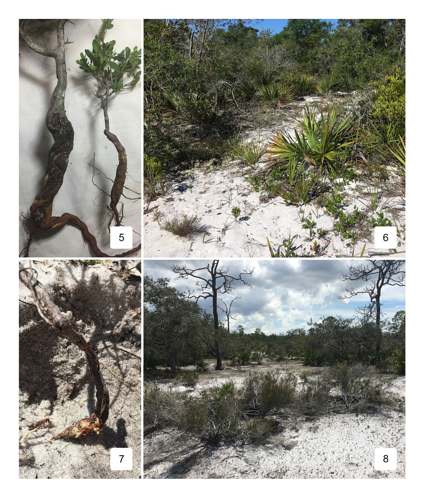
Figures 5-8. Root damage and habitat of Plesioclytus . 5) Damage to roots of P. polygamum by P. relictus . 6) Habitat of P. polygamum and P. relictus in Highlands County, Florida. 7) Active damage by P. relictus in root of P. polygamum . 8) Habitat of P. polygamum and P. relictus in Collier County, Florida.