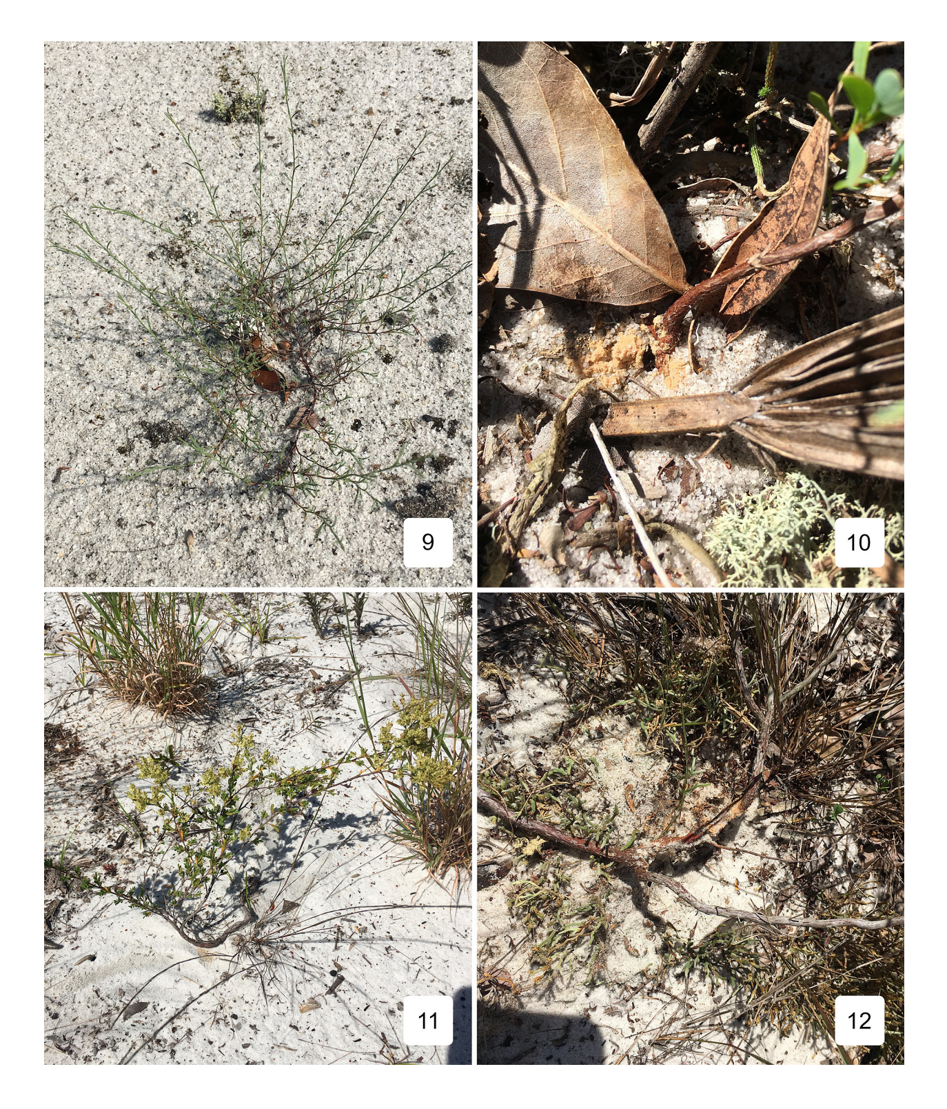
Figures 9–12. Root damage and habitat of Plesioclytus. 9) Specimen of P. polygamum with larvae of P. relictus in open sand in Emanuel County, Georgia. 10) Active damage by P. relictus in root of P. polygamum . 11) Blooming specimen of P. polygamum in open sand with larvae of P. relictus . 12) Active damage in stem of P. polygamum containing P. relictus covered by sand.