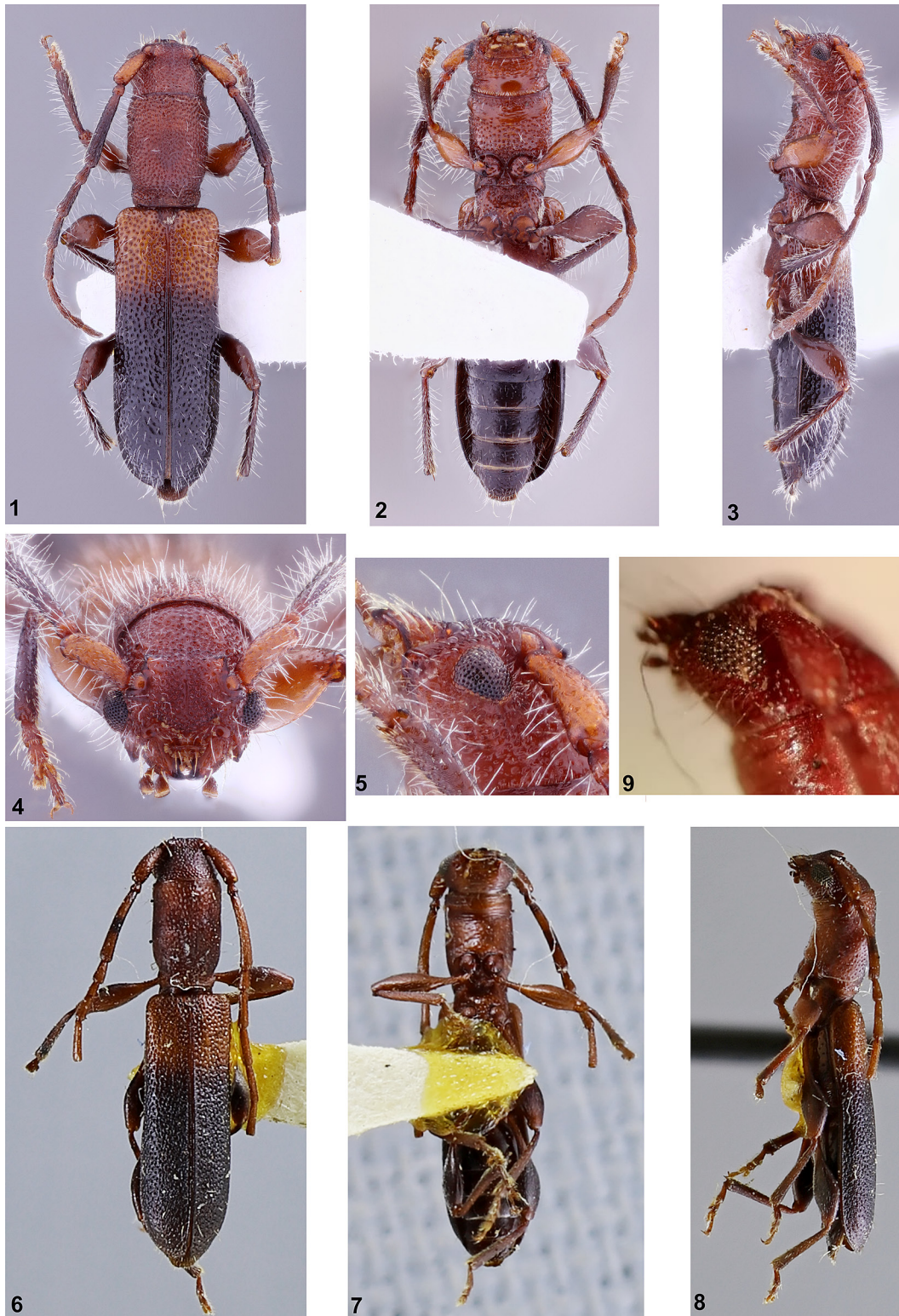
Figures 1–9. Xalitla species. 1–5) Xalitla limoni , holotype female. 1) Dorsal habitus. 2) Ventral habitus. 3) Lateral habitus. 4) Head, frontal view. 5) Head, lateral view. 6–9) Xalitla azteca , holotype female. 6) Dorsal habitus. 7) Ventral habitus. 8) Lateral habitus. 9) Head, lateral view.