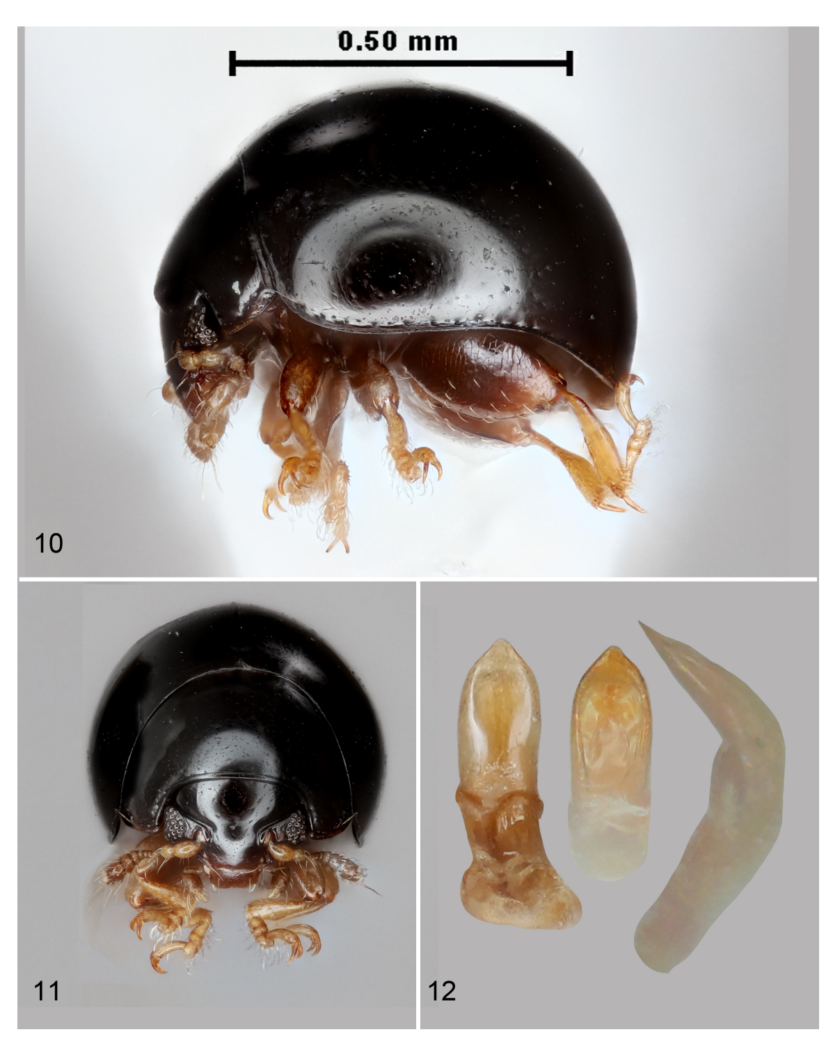
Figures 10–12. Kiskeya elyunque Konstantinov and Konstantinova, 2011. 10) Habitus, lateral. 11) Habitus, frontal. 12) Median lobe of aedeagus, ventral, dorsal, and lateral views.