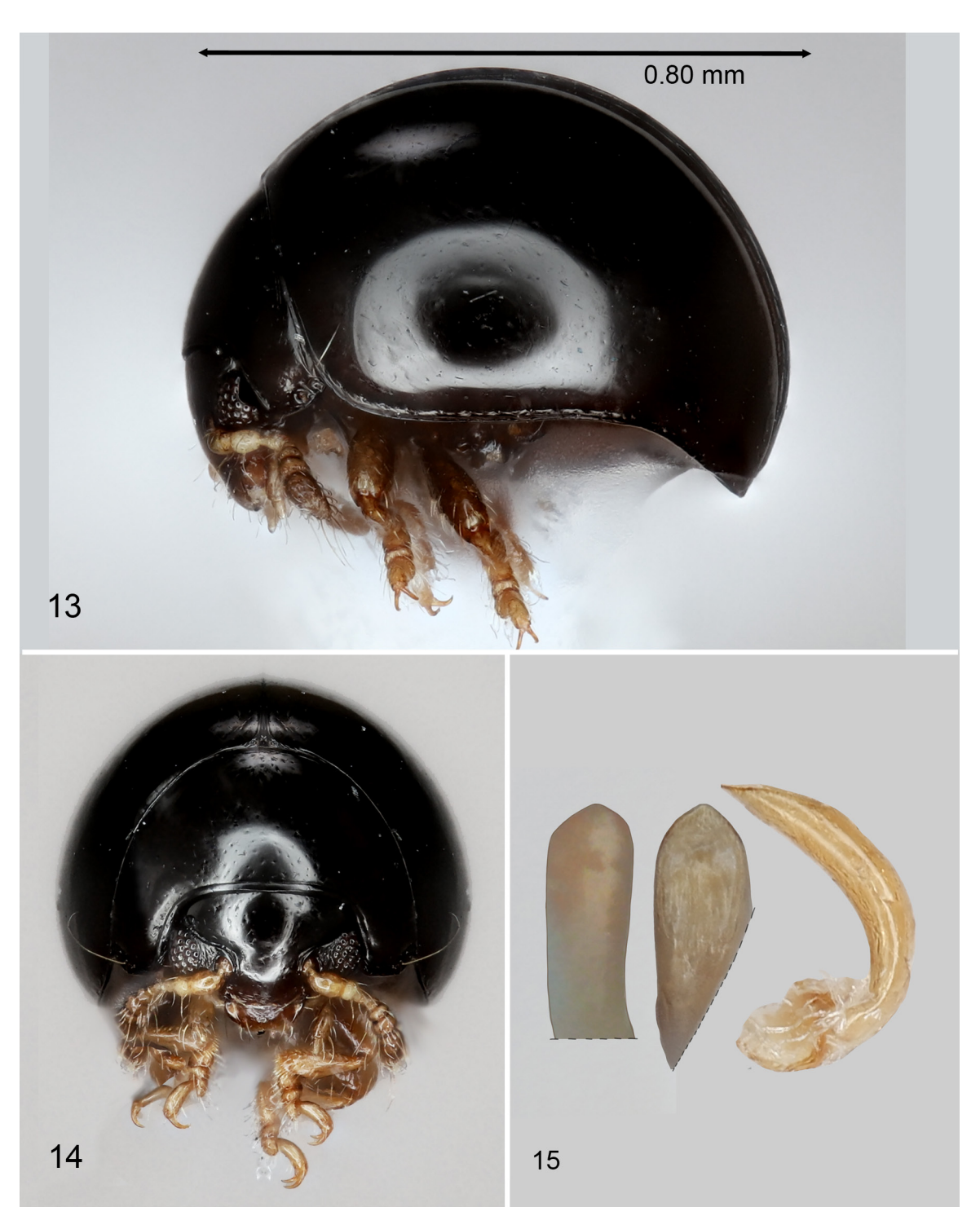
Figures 13–15. Kiskeya micheliorum new species. 13) Habitus, lateral. 14) Habitus, frontal. 15) Median lobe of aedeagus, ventral, dorsal, and lateral views.