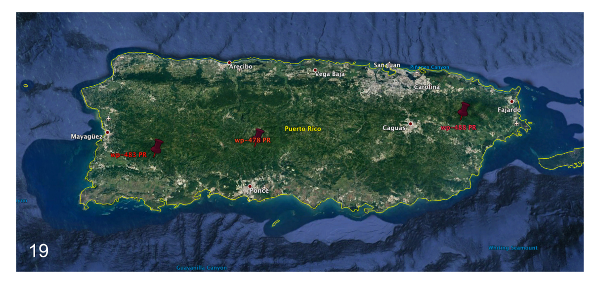
Figures 19. Map of Puerto Rico with marked collecting localities for moss-inhabiting flea beetles.