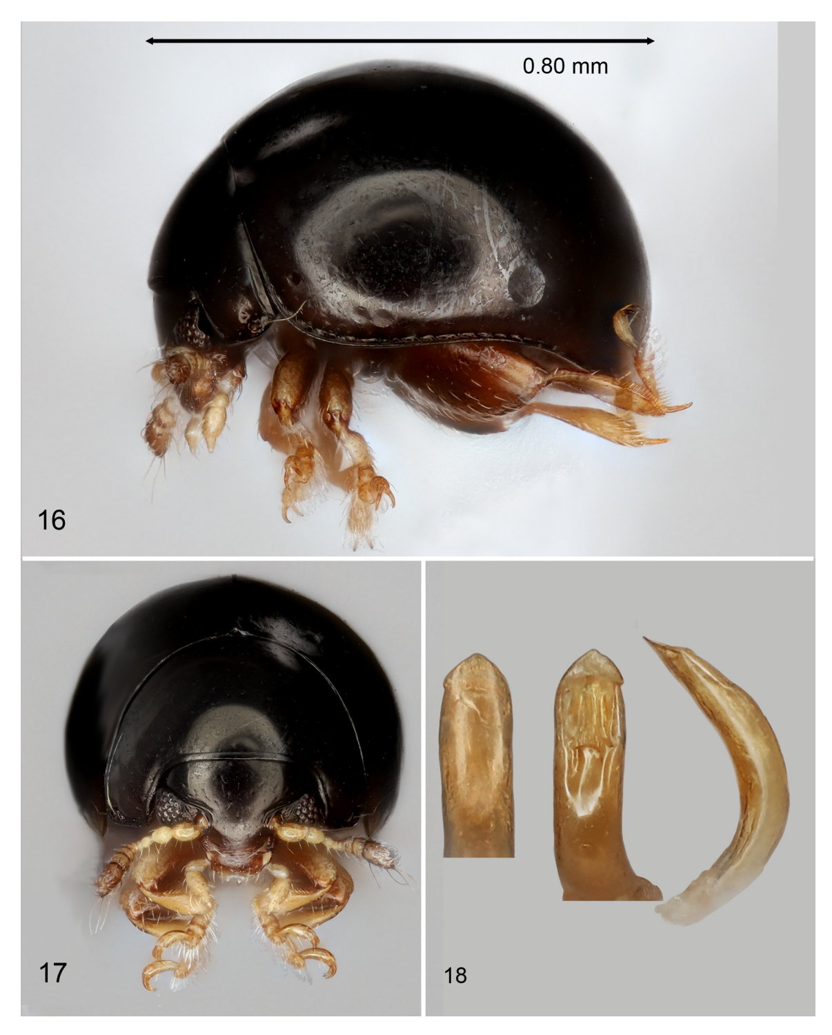
Figures 16–18. Kiskeya segarrai new species. 16) Habitus, lateral. 17) Habitus, frontal. 18) Median lobe of aedeagus, ventral, dorsal, and lateral views.