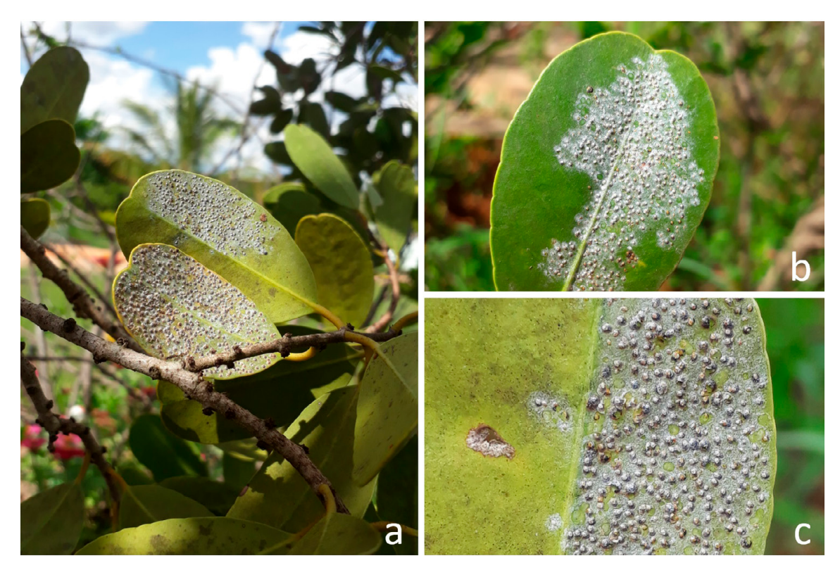
Figure 1. Pseudoparlatoria argentata associated with Salacia crassifolia in Brasilia, Brazil. a) S. crassifolia tree infested with diaspidids. b) Lower surface of leaf highly infested with diaspidids. c) Detail of the P. argentata scales.