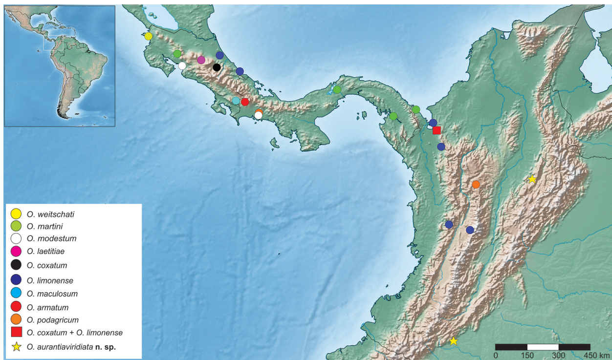
Figure 3. Oncotophasma species distribution, referenced from the northernmost to the southernmost species: O. weitschati Zompro, 2007; O. martini (Griffini, 1896); O. modestum Zompro, 2007; O. laetitiae Bellanger, 2016; O. coxatum (Brunner von Wattenwyl, 1907); O. limonense Zompro, 2007; O. maculosum Zompro, 2007; O. armatum (Brunner von Wattenwyl, 1907); O. podagricum (Stål, 1875) and O. aurantiaviridiata Murcia, Cadena-Castañeda and Silva new species .

Stick insects have different defense mechanisms, such as cryptic coloration, thanatosis, autotomy (freeing themselves from a limb to escape predators) (Bedford 1978; Murcia et al. 2017), and defensive chemicals from prothoracic glands in the form of a spray, which can be shot several centimeters away (Zompro 2002). Robinson (1968) described a defensive behavior of O. martini , which consists of repeatedly moving the mesofemur to allow the spines present on it to touch and pierce the predator which is trying to hinder the phasmid movement. Thus, it is likely that O. aurantiaviridiata new species has the same defensive pattern as their spines in the mesofemur are noticeably larger when compared to O. martini . The same pattern is observed in the Australian Eurycantha Boisduval, 1835. Furthermore, the intense coloration of the new species may indicate a possible aposematism relation with local predators and mimicry of some tropical plants.