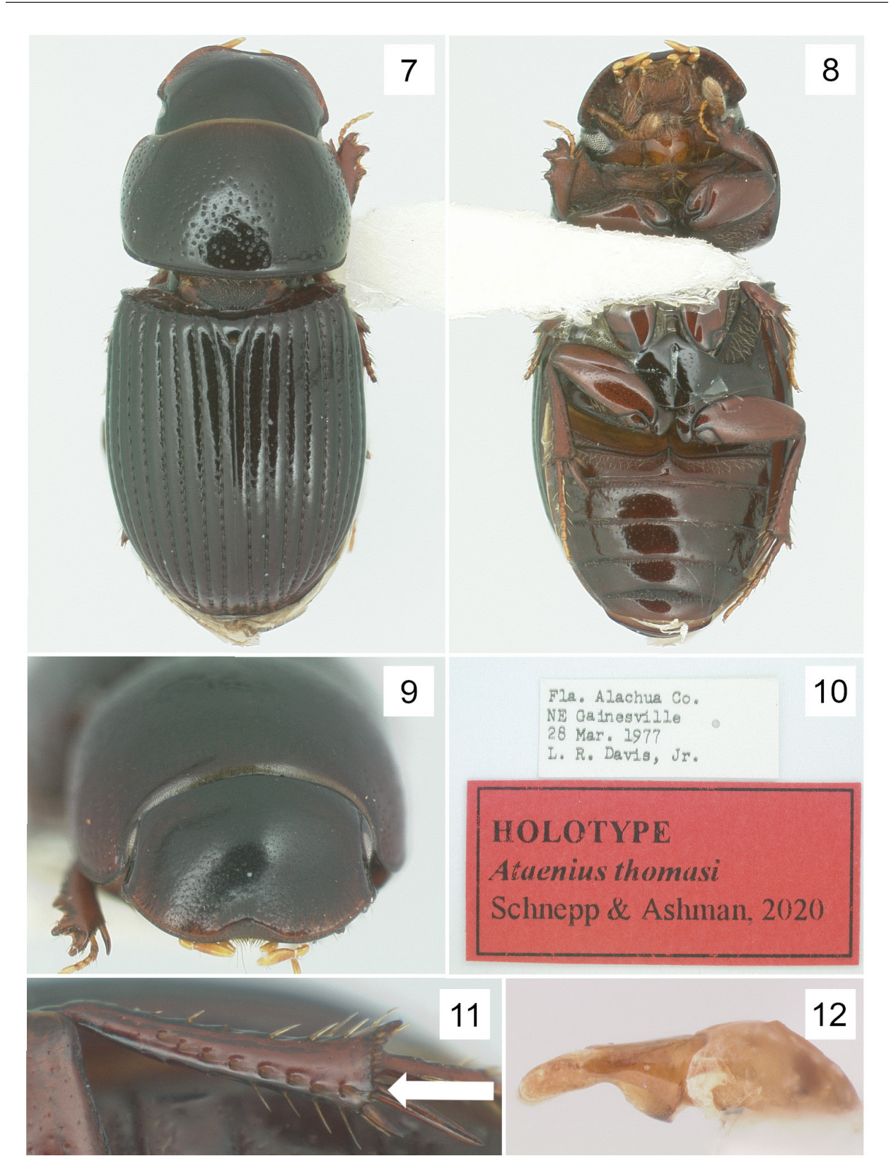
Figures 7–12. Ataenius thomasi Schnepp and Ashman. 7) Dorsal view of holotype. 8) Ventral view of holotype. 9) Frontal view of holotype. 10) Holotype labels. 11) Ventral view of metatibia of holotype, arrow indicates reduced accessory spine. 12) Male genitalia of paratype.