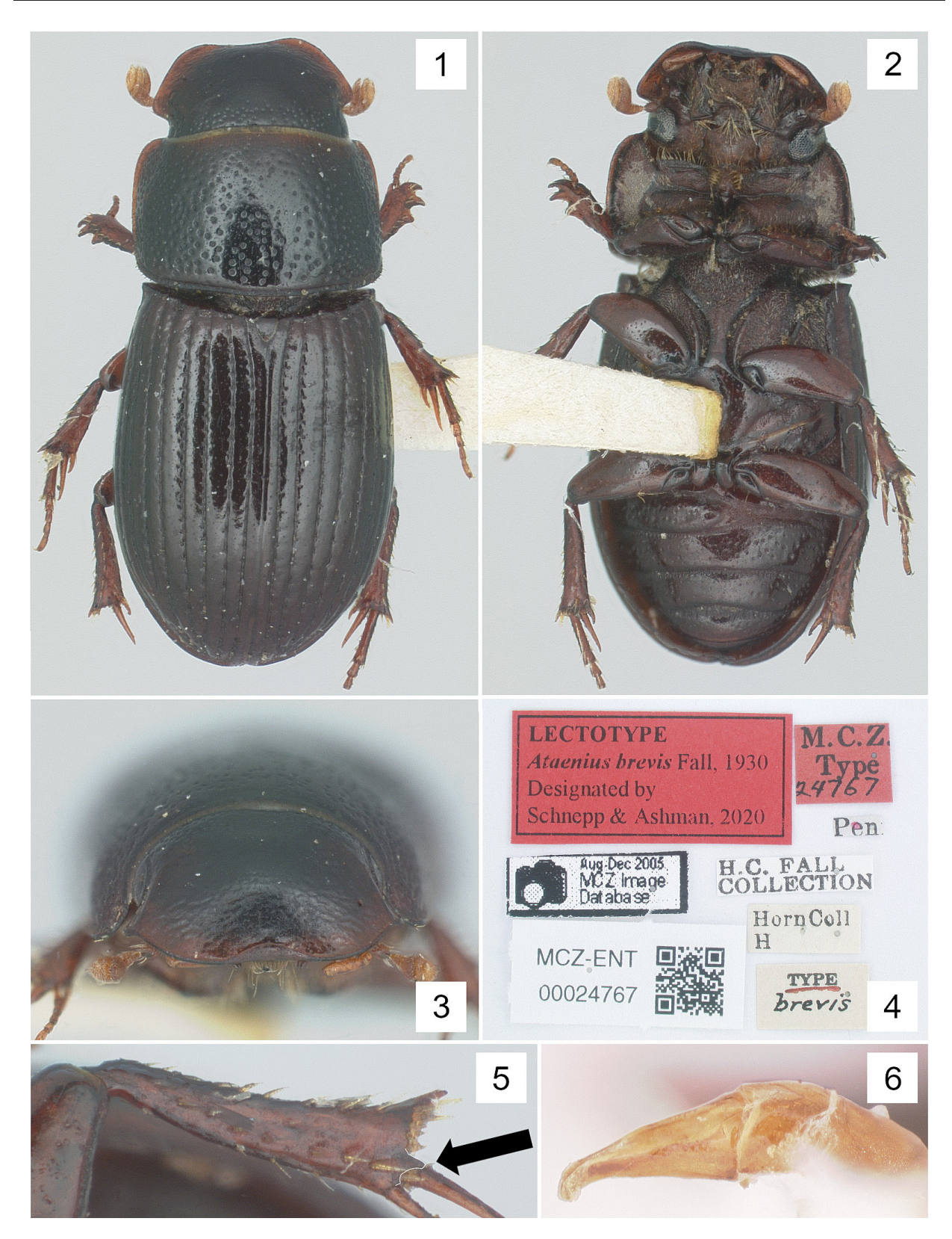
Figures 1–6. Ataenius brevis Fall. 1) Dorsal view of lectotype. 2) Ventral view of lectotype. 3) Frontal view of lectotype. 4) Lectotype labels. 5) Ventral view of metatibia of lectotype, arrow indicates outlined accessory spine. 6) Male genitalia, specimen from Citico, Tennessee.