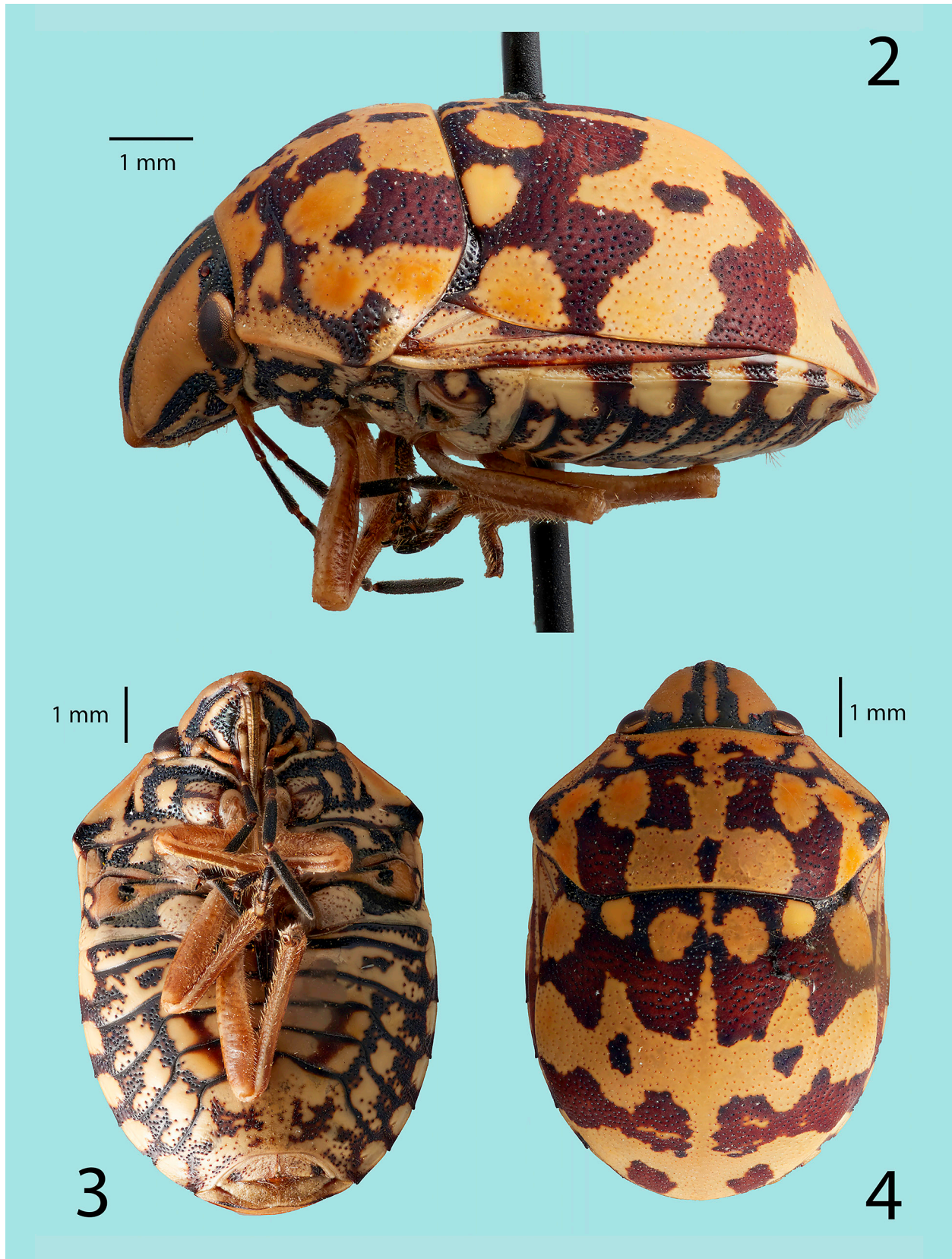
Figures 2–4. Orsilochides scurrilis . 2) Lateral view. 3) Ventral view. 4) Dorsal view. Dimensional lines = 1.0 mm.