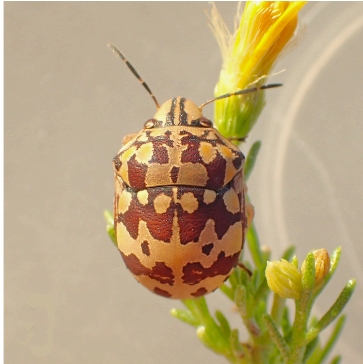
Figure 1. Live Orsilochides scurrilis specimen

verification of the specific identification. The authors suspected that this specimen represented the first record of the species in the U.S. and the first record of the genus in the state of Arizona. Because this genus has received limited attention in the U.S., this record also provided an opportunity to further investigate the distribution of O. stictica and O. guttata within the country. With all of this in mind, the authors began contacting museums and searching digital records in an effort to determine whether this was, in fact, the first U.S. record of O. scurrilis and to update the distributions of previously recorded U.S. species of Orsilochides .