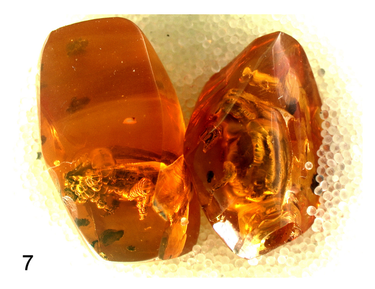
Figure 7. Priscyparus quisqueyensis , new species, paratypes.

Comments. This species is unusual in its combination of characters, as well as having a few unique characters. The pronotal costae are greatly raised, even more than is seen in Termitodius . Most other characters are similar to Termitodiellus Nakane from SE Asia, Indonesia and New Guinea. The elongate, posteriorly projecting discomedian costa and caudal bulb of the elytra are seen in Termitodiellus besucheti (Paulian) and Termitodiellus hammondi (Krikken and Huijbregts) from Borneo and Sumatra (Krikken and Huijbregts 1987, fig. 13–14). However, Termitodius and Termitodiellus have different tibial types than Priscyparus which has a mesotibia with an inwardly directed spine on inner apex. This is the Rhyparus -type tibia found in Rhyparus and closely related genera (Skelley 2007).