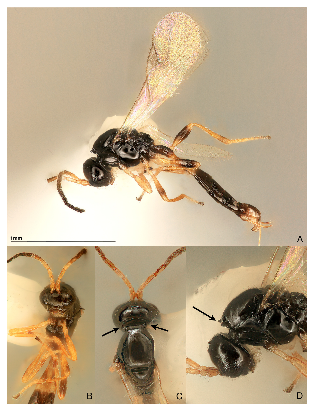
Figure 1. Ishtarella thailandica Martens gen. nov., sp. nov., \bigcirc . A) Habitus, lateral view. B) Head, frontal view. C) Head and mesosoma, dorsal view; arrows indicate mesoscutal horns. D) Head and mesosoma, lateral view; arrow indicates mesoscutal horns.