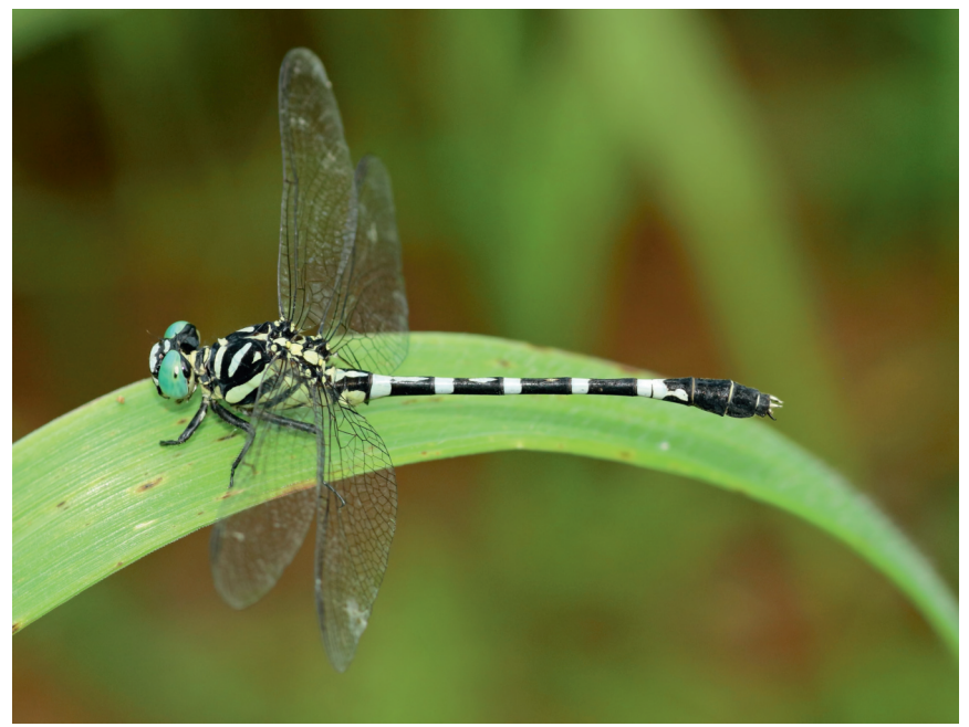
Fig. 2. Anisogomphus yingsaki Makbun, 2017, male. Thailand, Sakon Nakhon, Ban Na Kha, 5-vii-2020.