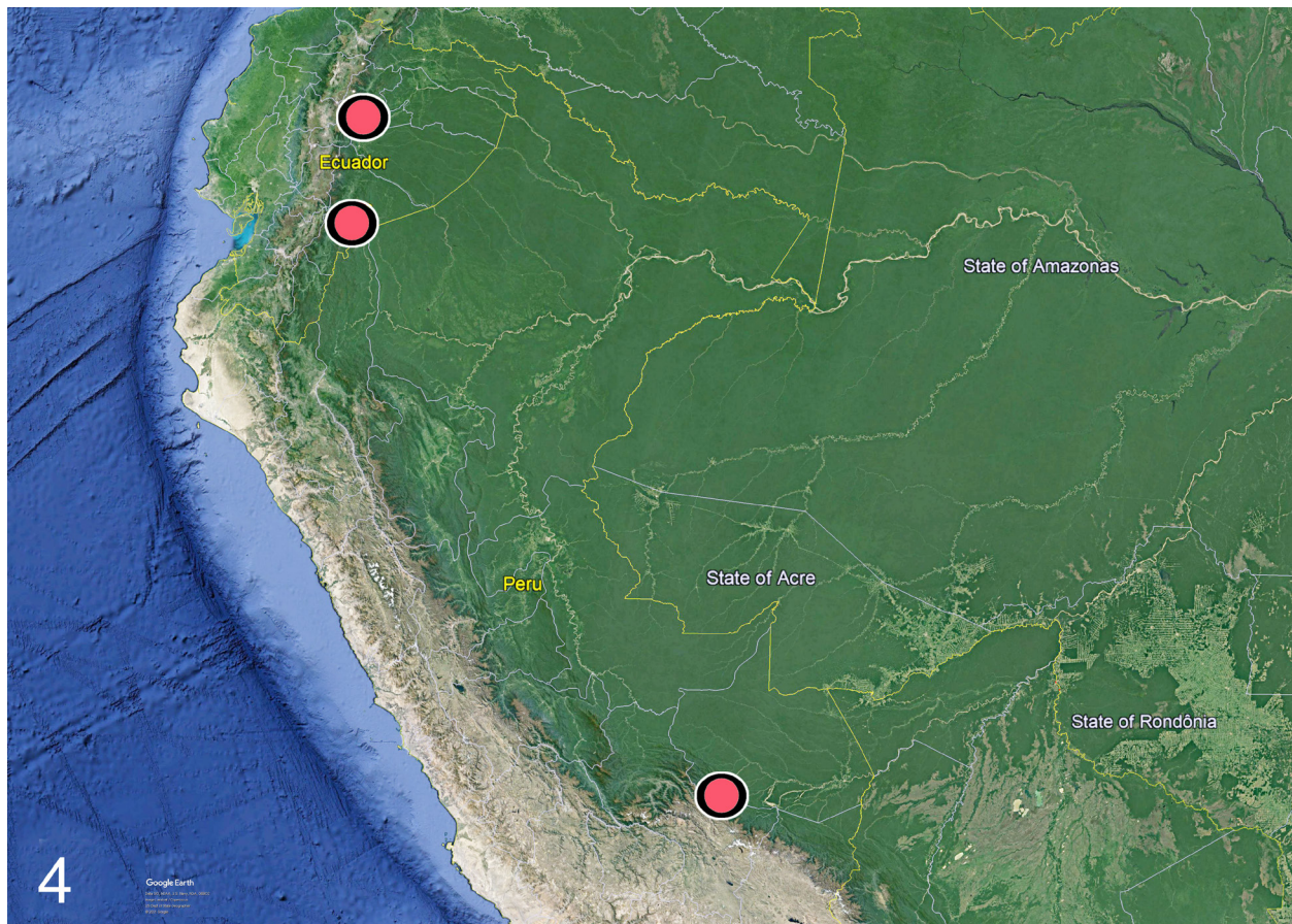
Figure 4. Distribution of Grishinata penny in Ecuador and Peru.