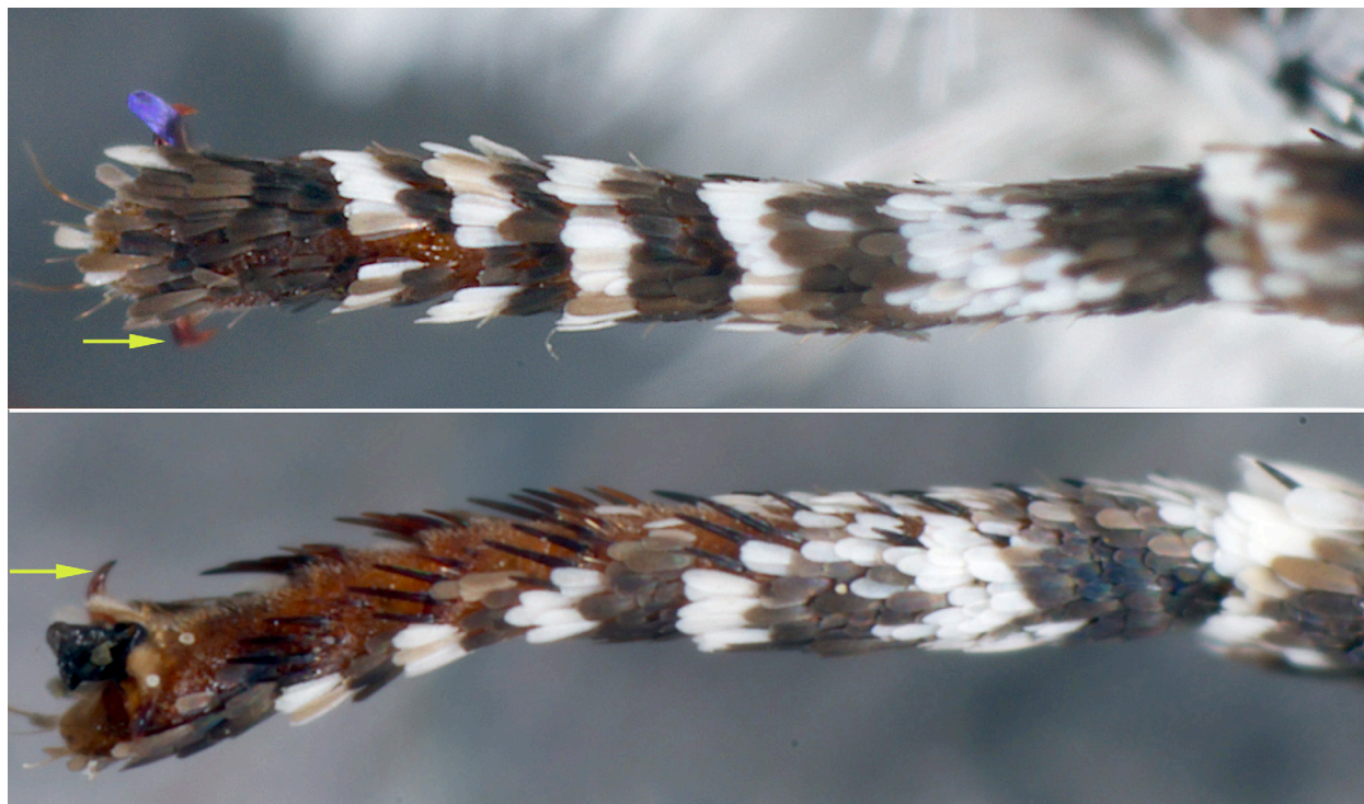
Figure 2. Male foretarsus of Grishinata penny showing five tarsal segments and pretarsal claws (yellow arrows). Dorsal (top) and lateral aspects.

references are Borror et al. (1981) for wing veins and Klots (1970), as modified by Robbins (1991), for genitalia. Specimens cited in this study are deposited in the following collections.