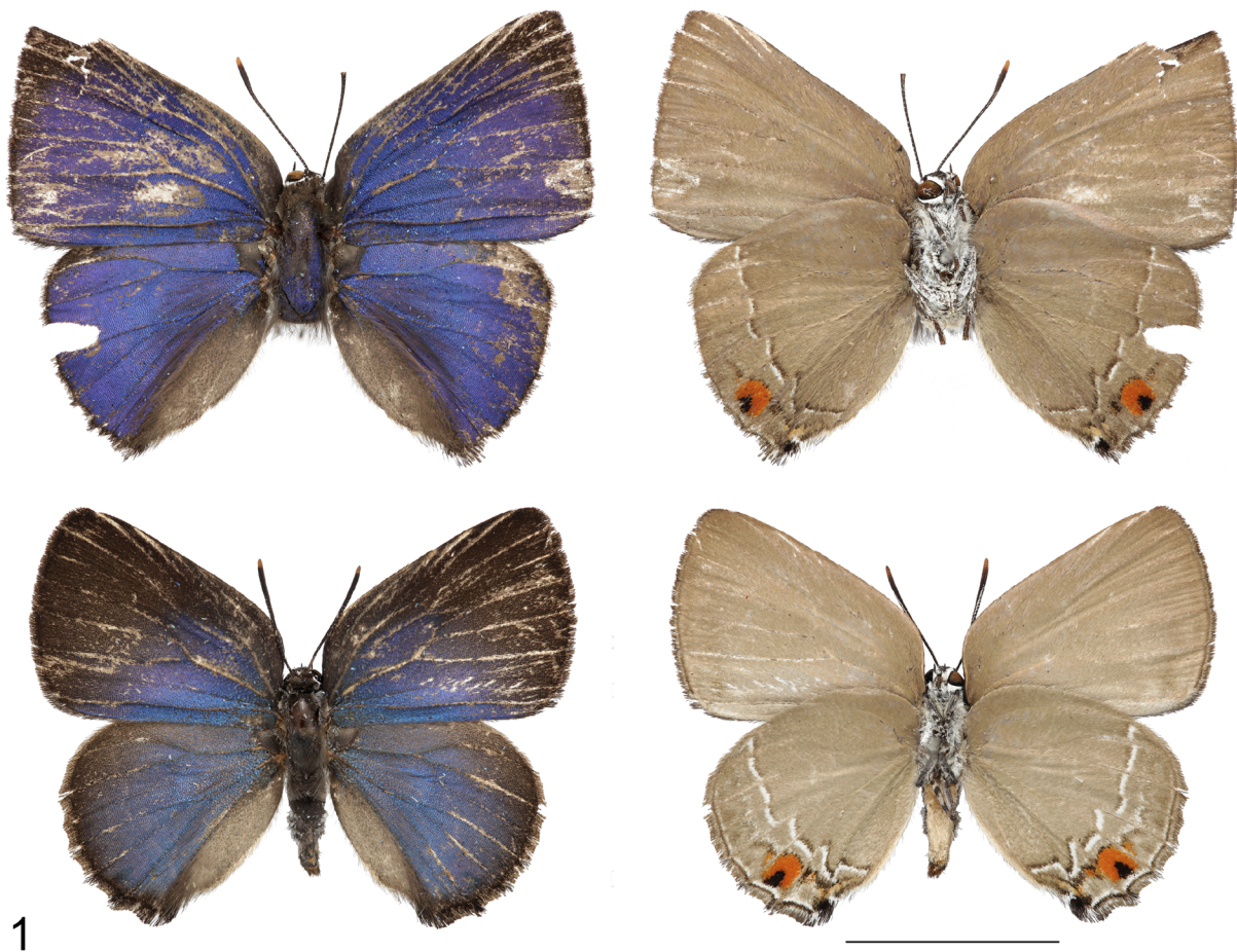
Figure 1. Adult Grishinata penny . Male holotype dorsal and ventral wings (top). Female dorsal and ventral wings (bottom). Scale 1 cm.

Labels on the holotype are recorded verbatim with brackets used for information not explicitly noted on the labels and for descriptions of the labels. Otherwise, months are abbreviated by their first three letters in English. A unique combination of morphological characters is the basis for proposing the new taxonomic names. Standard