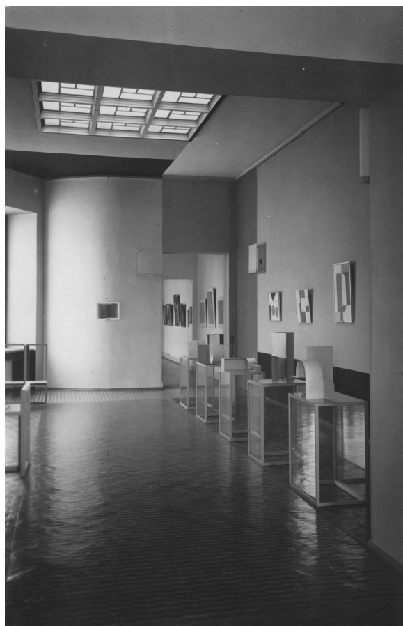
Figure 2. Władysław Strzemiński, Neoplastic Room , view of 1948–1950.

there should be an extension of the first Neoplastic Room to a second room, called the Small or Second Neoplastic Room, to increase the size of the display space and provide an opportunity to demonstrate the theory of Neoplasticism relating to the penetration of coloured planes and the functioning of their rhythm in infinite space.