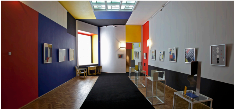
Figure 1: Władysław Strzemiński, Neoplastic Room , 1948/60. Reconstruction by Bolesław Utkin; view of 2010. Archive of the Muzeum Sztuki, Łódź, photo Piotr Tomczyk.

‘revolutionary artists’ or ‘real avant-garde’) initiated two years earlier by the Polish artists Władysław Strzemiński, Katarzyna Kobro, Henryk Stażewski, Jan Brzękowski, and Julian Przybos. The project of the Room raised many questions: how should a homogeneous art complex in a museum be ideally displayed? Should the museum create a special space for a specific collection to reflect the assumptions and ideas of the artists? To what degree can the artistic trend be legible for future generations?