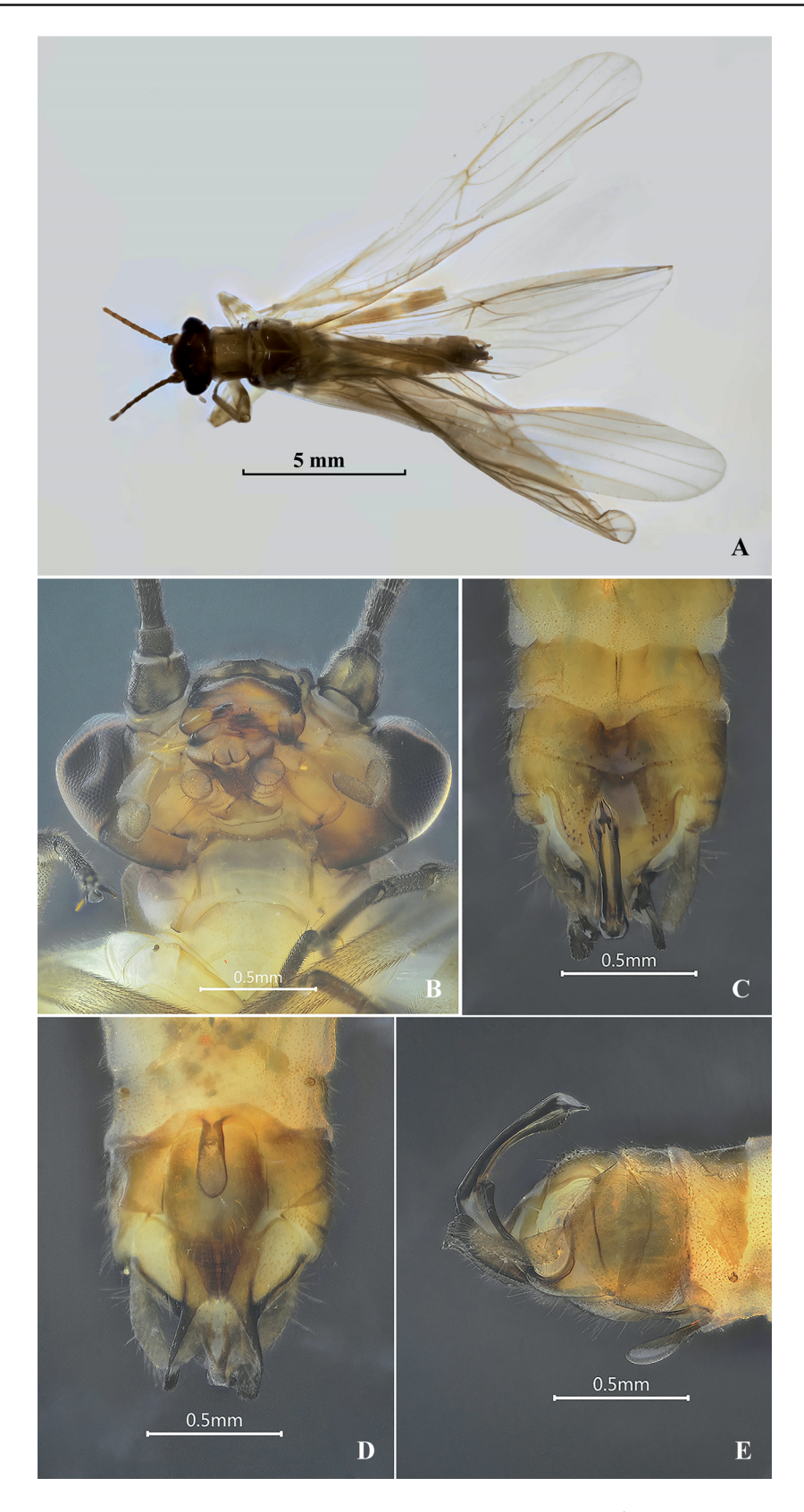
Fig. 1. Indonemoura yingjiangensis Bai & Qian sp. nov., holotype, ♂ (SWFU). A . Habitus, dorsal view. B . Head and prothorax, ventral view. C . Terminalia, dorsal view. D . Terminalia, ventral view. E . Terminalia, lateral view.