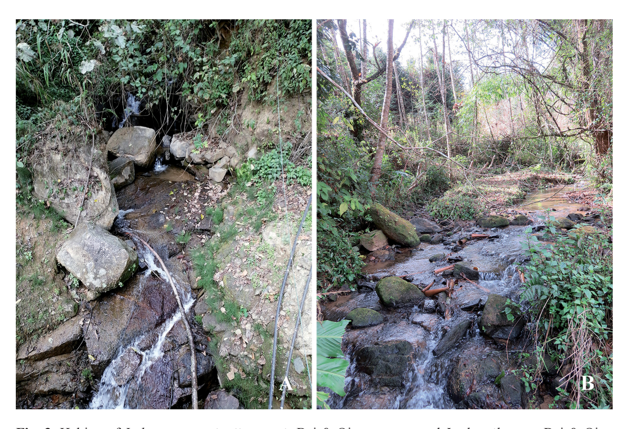
Fig. 3. Habitat of Indonemoura yingjiangensis Bai & Qian sp. nov. and In. longihamata Bai & Qian sp. nov. in Tongbiguan Provincial Nature Reserve. A. The upper reaches of unknown streams. B. The lower reaches of unknown streams.

ABDOMEN (Fig. 2A, C). Abdominal segments generally brownish-yellow and weakly sclerotized. Tergum 9 weakly sclerotized with a thin and transverse sclerite on mid-anterior margin. Tergum 10 weakly sclerotized, median concaved below epiproct, a transverse arc-shaped sclerite anteriorly, two irregular