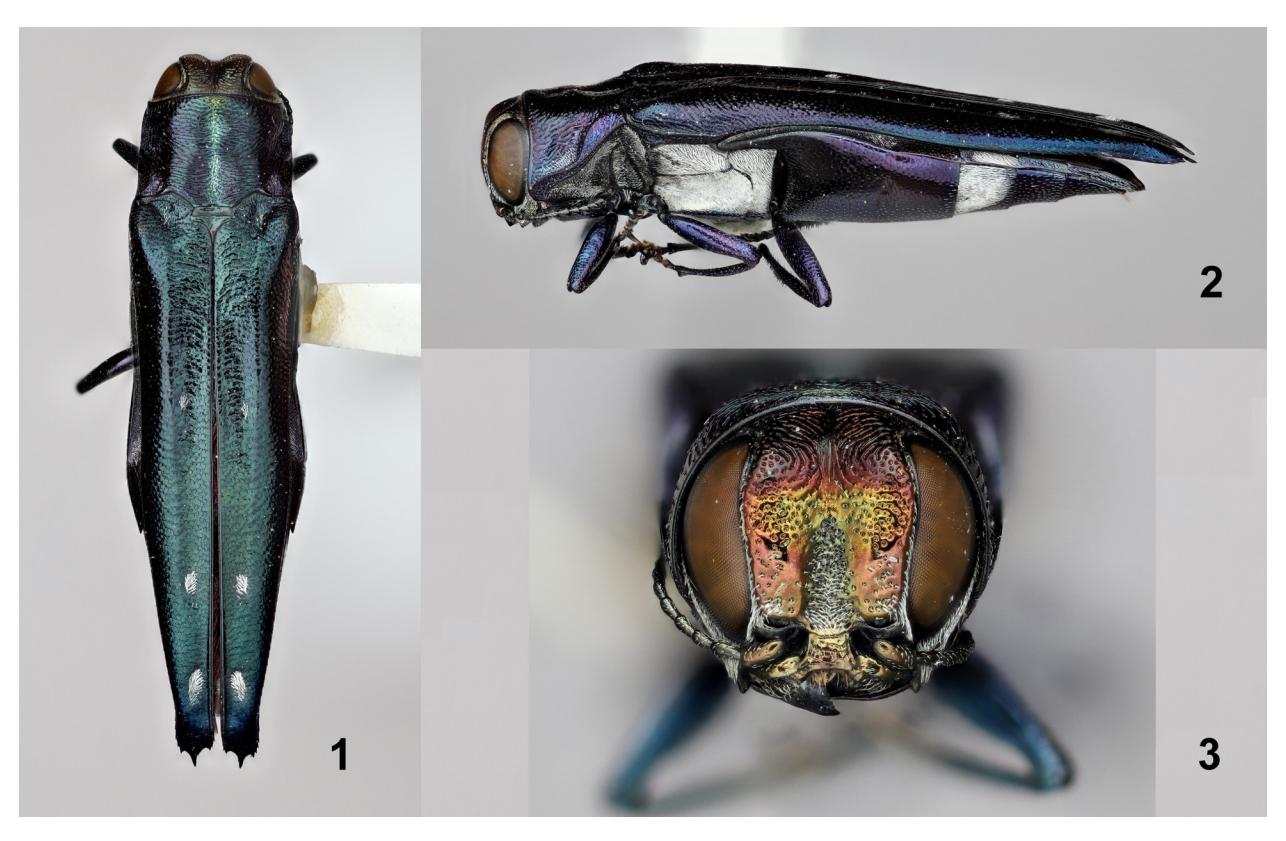
Figures 1–3. Views of holotype of Agrilus lopezi (Fisher). 1) Dorsal habitus. Length = 11.5 mm. 2) Lateral habitus. 3) Anterior view of head.

pattern of whitish pubescence, often with a broad band in the apical third; and the elytral apices truncate to rounded, without strong spines. Agrilus lopezi has a slender appearance, the prehumeral carina of the pronotum well developed and sharp, and the elytral apices with a strongly developed medial spines.