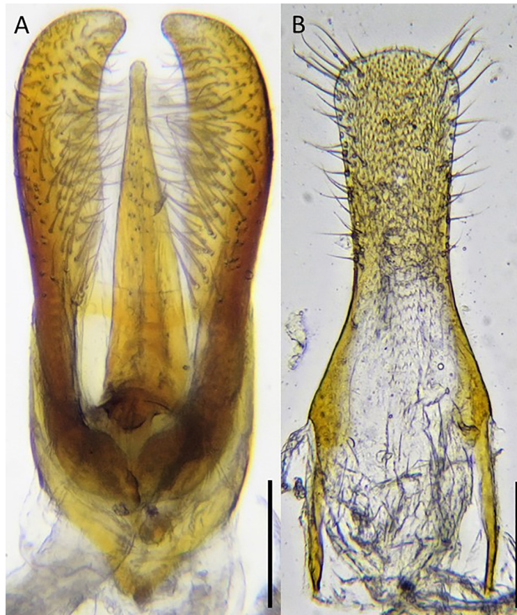
Figure 5. Anthrenus pimpinellae . A) Aedeagus dorsal aspect. B) Sternite IX. Scale bar = 100 \mu m in both cases.

The number of known species within the Palearctic A. pimpinellae complex continues to increase. Holloway and Herrmann (2024) list 25 species, this study increases the number to 26. This is the third A. pimpinellae lookalike species described from Europe, the others being A. amandae Holloway, 2019 from Mallorca and A. chikatunovi Holloway, 2020 from the Pyrennees. As well as similar color patterns, all also have quadrate antennal clubs. Insect