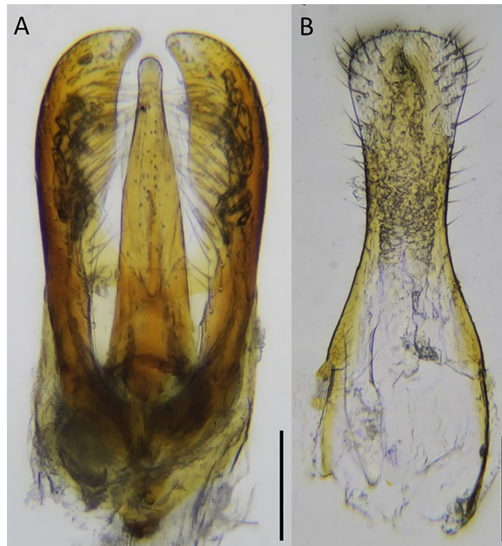
Figure 2. Anthrenus quernerii . A) Aedeagus dorsal aspect. B) Sternite IX. Scale bar = 100 \mu\text{m} in both cases.

Sternite IX (Fig. 2B, SL = 473 \mu\text{m} ) with broad posterior lobe. The apex is clear laterally, the rest of the sternite is pale brown. The medial apex of the posterior lobe is a smooth, shallow curve. The clear lateral components of the apex are covered in setae, longest towards the lateral corners and absent along the apical margin. The setae