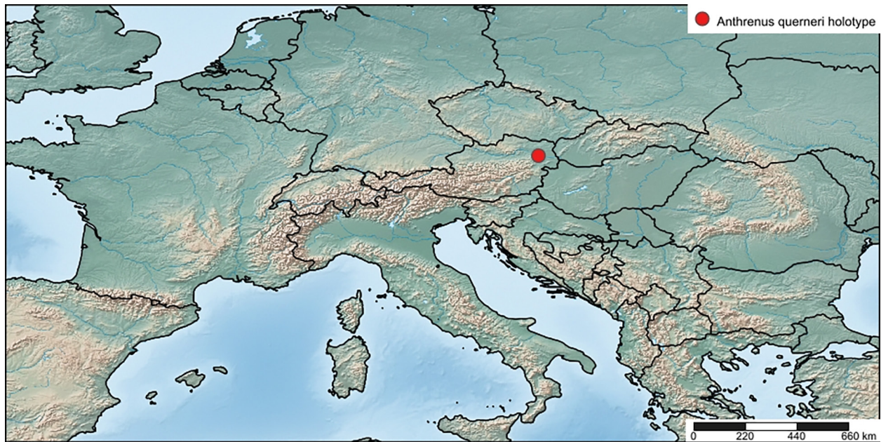
Figure 3. Location of collection of Anthrenus quernerii holotype.

extend down the lateral margins becoming progressively shorter to the mid-point where the margins narrow to form a neck. From the neck, the margins diverge and continue as smooth curves to the anterior, ending in two narrow, curved horns.