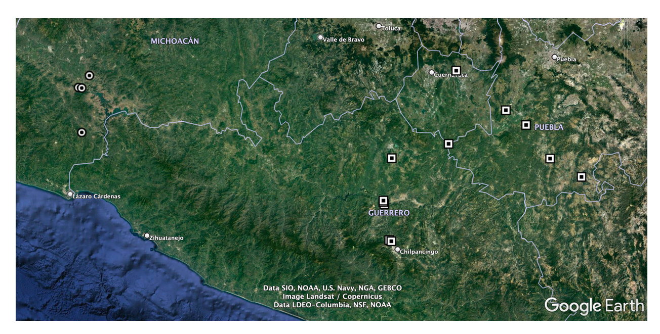
Figure 2. Distribution of Acmaeodera parasuperba, new species (circles) and A. superba (squares).