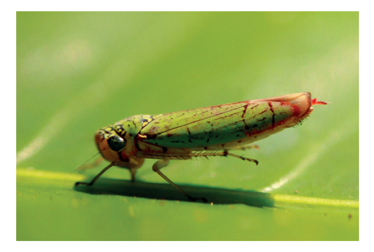
Fig. 17. Prodigiella silvanoi gen. et sp. nov., \mathcal{Q} , photographed at Parque Estadual da Pedra Branca, Municipality of Rio de Janeiro, southeastern Brazil. See discussion for notes on the records of the new species from State of Rio de Janeiro.

COLORATION (Figs 1–3, 17). Anterior dorsum (crown, pronotum, and mesonotum) greenish-yellow mottled with irregular dark brown lines and spots; posterior <sup>2</sup>/<sub>3</sub> of pronotal disc with large dark green area. Forewing with corium and clavus mostly green with veins partially dark brown; distal half with irregular transverse dark brown markings (other irregular small dark brown markings may also be present); apical portion with large, arcuate dark red to brown area located before well-defined translucent membrane; irregular greenish-yellow markings and areas may be present along costal margin and on veins. Ground color of face mostly yellow; frons laterally with transverse brown stripes associated with muscle impressions and centrally with small irregular brown markings. Legs yellowish-brown to brown. Abdomen with tergites and outer portion of laterotergites red; inner portion of laterotergites and sternites brown ish-yellow with irregular dark brown markings; male genital capsule red to brown laterally and dorsally (pygofer) and brown ventrally (valve and subgenital plates); female with sternite VII brownish-yellow, pygofer red dorsally and brownish-yellow ventrally, gonoplac brown.