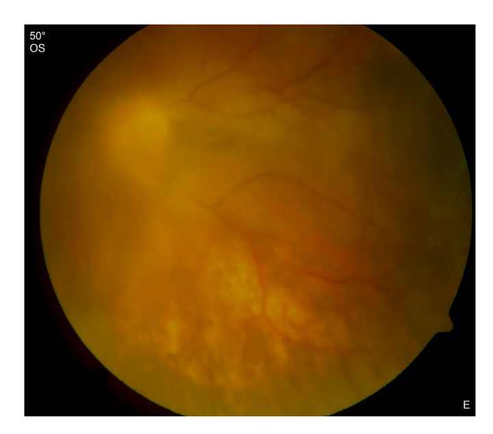
Fig. 6. Fundus of the left eye, 2.5 months after ophthalmic artery occlusion. The optic nerve is pale with indistinct margins, very poor to no retinal artery filling, partially slightly increased retinal vein caliber, no cherry red spot and ischemic areas are detectable. (For interpretation of the references to colour in this figure legend, the reader is referred to the Web version of this article.)

occlusion of branches of the ophthalmic artery. A study analyzing different fillers even reported that the glabella area was the most common injection site leading to this complication.<sup>2</sup> The pathomechanism can be explained by the anatomical proximity of the supratrochlear artery and the glabella. The supratrochlear artery is a terminal branch of the ophthalmic artery and due to its superomedial location at the orbit and extensive vascular anastomoses on the forehead, it can be unintentionally injected<sup>3</sup> or the injection needle may break its wall.<sup>4</sup> An adequate amount of product in combination with the injection force, which can overcome the systolic arterial pressure, can press the droplet towards the ophthalmic artery and lead to retrograde occlusion<sup>1,2,4</sup> and consecutive anterograde multifocal obstruction at the end of the injection, when the pressure gradient changes and the arterial systolic pressure pushes the droplets anterogradely. <sup>2,4</sup> Injection volumes of <0.1 ml can fill the entire volume of the supratrochlear artery from injection site at the glabella to the level of the orbital apex<sup>3</sup> and it was reported that 0.2 ml and 0.4 ml of injected hyaluronic acid could already cause permanent and complete vision loss. In our case, the injection of 0.7 ml of hyaluronic acid into the supratrochlear artery resulted in occlusion of the ophthalmic artery and its branches.