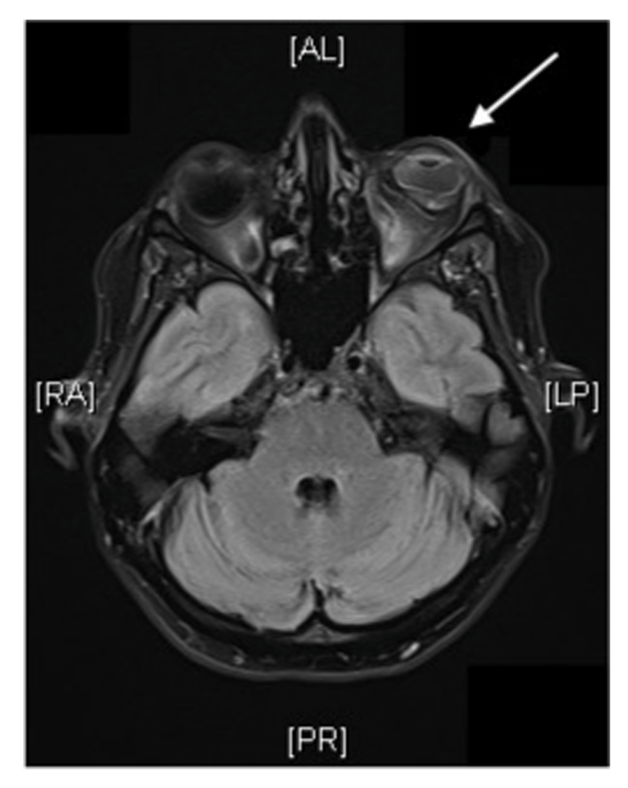
Fig. 3. Magnetic resonance brain imaging (T2 sequence, TIRM, dark-fluid, transverse section) 9 days after ophthalmic artery occlusion after hyaluronic acid filler injection. The extent of the deformed, collapsed left globe (arrow) gets obvious. Signal enhancement in the left orbit is detectable, indicating increased liquid content.

retinal artery filling with ischemic retinal areas. The OCT revealed internal and external retinal atrophy with loss of retinal architecture (Fig. 5). 2.5 months after the incident the clinical findings remained constant (Fig. 6).