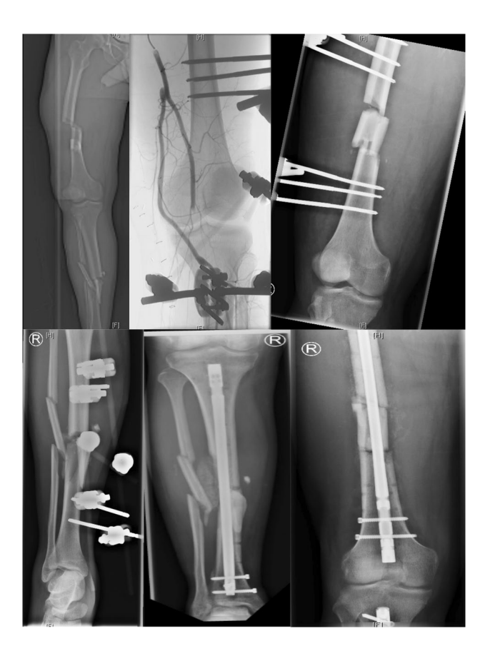
Fig. 4 Anterior–posterior radiographs and angiography of a 32-yearold patient with a complete knee dislocation in a motorcycle accident. The figure shows the initial CT-scout of the limb, the ruptured popliteal artery as well as the leg after treatment in stages with vein graft, external protective fixation, and intramedullary nails prior to ligament reconstruction

associated fractures allow an arthroscopic or open reconstruction. Hereby, the PCL, which is the strongest stabilizer of the knee [30], the LCL, and meniscal injuries as well as avulsions of the ACL are generally addressed first.