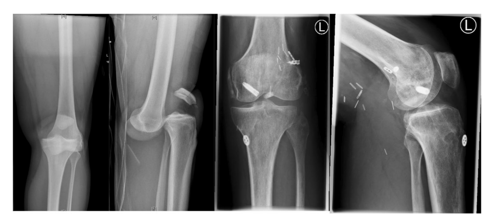
Fig. 1 Anterior–posterior and lateral radiographs of a posterior dislocation of the knee (Grade-A) and the joint after reduction, vain graft of the popliteal artery and surgical ligament repair of the posterior cruciate ligament (PCL), the anterior cruciate ligament (ACL), and the lateral collateral ligament complex (LCL)

open dislocations, or extensive soft tissue damage protective external fixation was applied. Further surgery was planned and consecutively performed in stages according to the injury pattern.