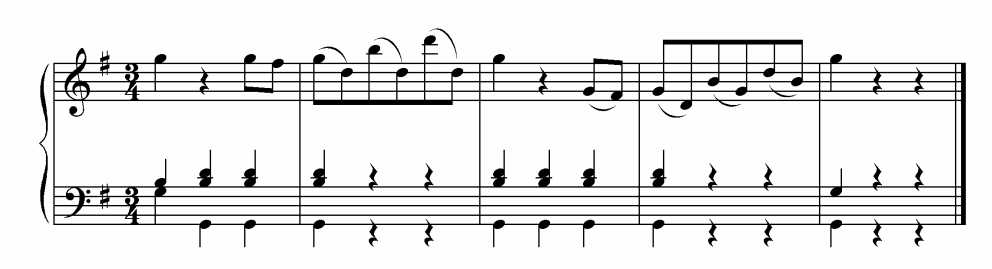
Example 1 Michael Haydn, "Die Hochzeit auf der Alm," overture, mm. 131-135

<sup>12</sup> See Wilhelm A. Bauer and Otto Erich Deutsch (ed.), Mozart, Briefe und Aufzeichnungen (Kassel: Bärenreiter, 1963-75), letters of 4 January 1783 (letter 719, lines 30-32); 12 March 1783 (letter 731, lines 28-34); 2 August 1788 (letter 1082, lines 19-25); 12 July 1791 (letter 1188, lines 11-12, 29-30). <sup>13</sup> Ibid., pp. 105-106.