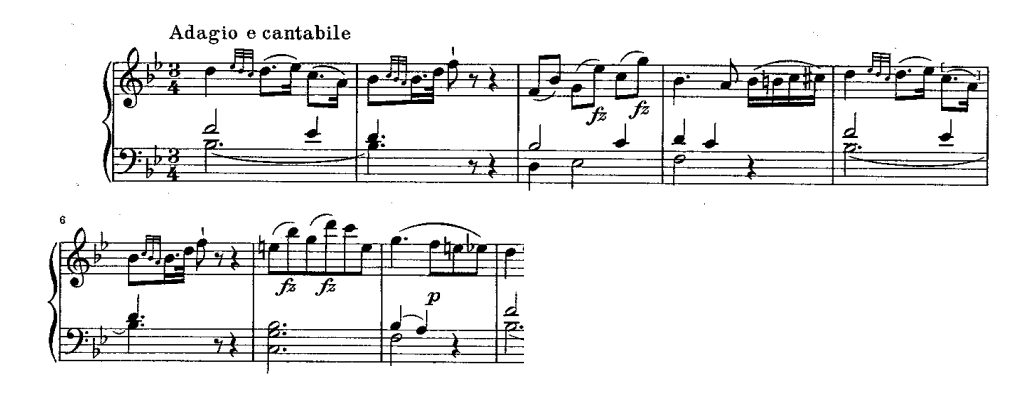
Example 2b Mozart: Piano Sonata in D major, K. 576, second movement, beginning