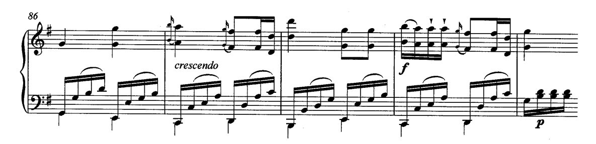
Example 1 Mozart, Piano Sonata in D major, K. 311, second movement, mm. 86-90

Literal performance of this passage without pedal is impossible except for those with very large hands.