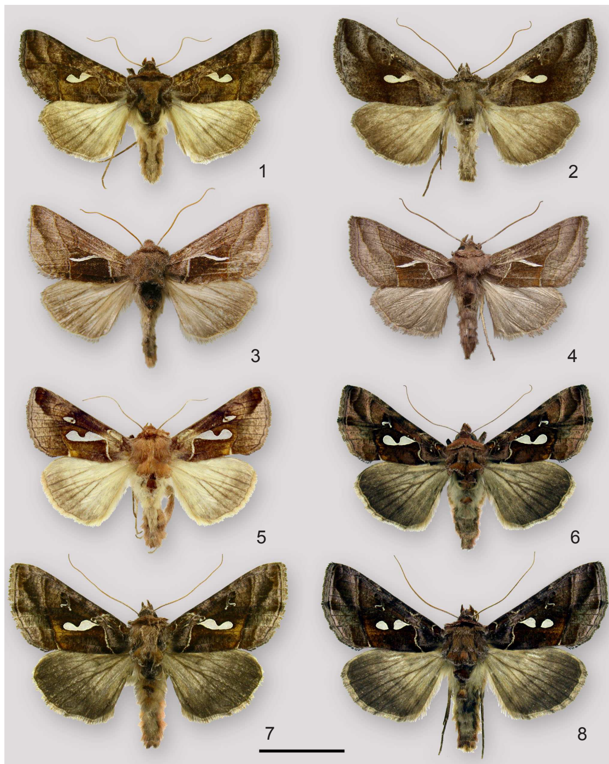
Figure 1–8. Megalographa spp. 1) M. monoxyla , m, Cochabamba, Incachaca, Bolivia. 2) M. agualaniata , m, Cochabamba, Incachaca, Bolivia. 3) M. culminicola , m, Ecuador. 4) M. culminicola , f, Junin to Huanuco Hwy., Pasco, Peru, 3600 m. 5) M. bonaerensis , m, Curitiba, 920 m, Paraná, Brazil. 6) M. biloba , m, San Gerardo de Dota, Cartago, Costa Rica. 7–8) M. talamanca , m, Reserva los Nimbulos, 3150 m, Cerro de la Muerte, San José, Costa Rica.