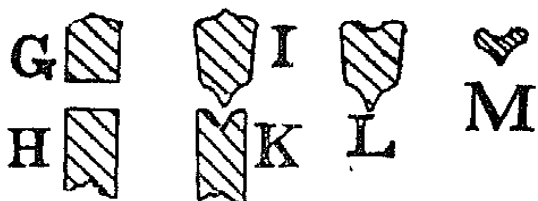
Figure 2.—Sectional diagrams, showing the elastico-viscous deformations of exuded cylinders of the charge C , Fig. 1, external pressure being zero.

rate in the lapse of time, is the chief feature. The case, however, is much more complex, for the restitution of volume is greatest in the axis of cylinder where the flow is a maximum, and it is accompanied by a series of distortions of the kind given in figure 2. Here G shows the shape of the cylinder or button immediately after cutting it off of the column H , surrounded by the steel transpiration tube. After 24 hours,