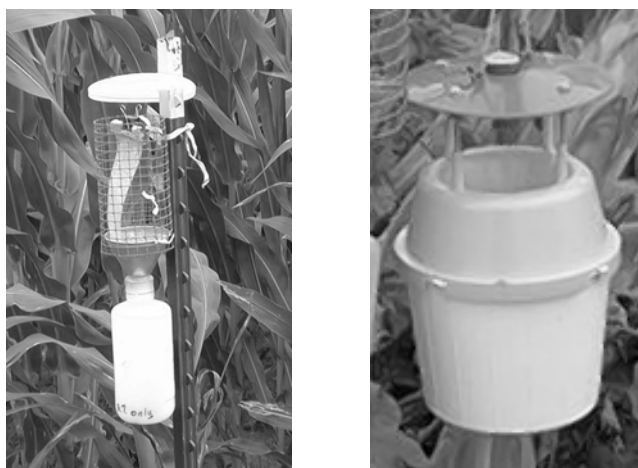
Fig. 1: IRC-high capacity trap (left) and Uni-trap (right) used for both mass trapping and diversion of D.v.v. in Illinois maize fields during the growing seasons of 2003 and 2004, resp. Mass trapped beetles are collected in bottom containers where they can be counted, sexed, and weighed.

Traps and lures: For the MSD technique, two types of high capacity D.v.v. traps were employed. The first, depicted in Fig. 1 (left), was developed and built by the authors in 2003. It was replaced in 2004 by the commercially available Uni-trap (see fig. 1 right), formerly used as Vario trap and purchased from Trifolio-M, D-35633 Lahnau.