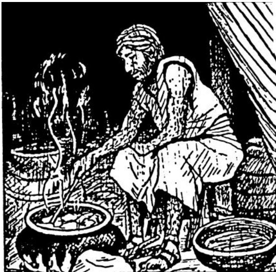
Nanae momo kukandyanga shakulya shakunogwa.