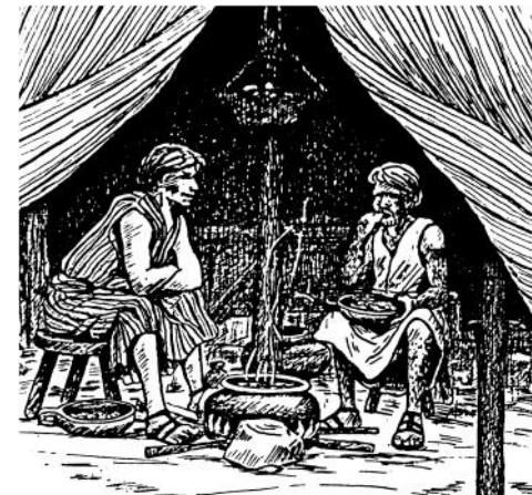
Ishau akalya shakulya shaumidye nnung'une.