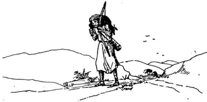
Muwakati wowo Ishau kuja kukulumbata.