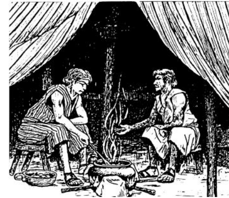
Ishau mwaa wakunkola indala namene andililapa. Akajaula shinang'olo shake kumwing'a nnung'une.