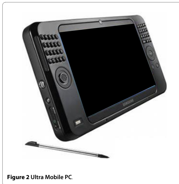
Figure 2 Ultra Mobile PC.

The Ultra Mobile PC can operated singlehanded and permits the exact time registration by touching the screen. After monitoring, data will be analysed statistically and graphically: the number of individual occur-