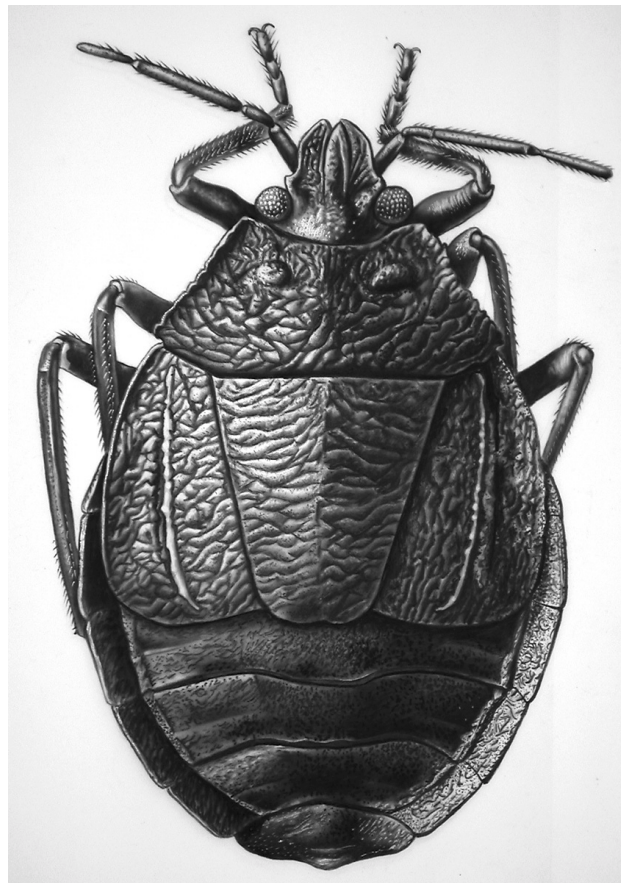
Figure 2. Hondocoris cavei , new genus, new species; dorsal habitus.

Description: Brachypterous; membranes of wings absent, hind wings absent; ocelli absent. Eyes contiguous with pronotum (Fig. 2). Humeral angles weakly and anterior pronotal angles not produced, pronotal margins not explanate. Scutellum short and broad, lateral margins straight, without frenal constriction or discontinuity; apex of scutellum attaining mid-abdomen (5th tergite). Meso- and metasternum thinly carinate on midline. Scent gland orifice round, without spout, but located on caudal side of short raised auricle which extends laterally about one-tenth distance to metasternal margin. Paired trichobothria located on each abdominal sternite behind and about half-way between each spiracle and lateral margin. Antennae five-segmented. Labium arising slightly before anterior limit of eyes; intercalary segment absent; basal segment projecting caudad of bucculae and attaining middle of prosternum. Pro- and mesotibiae prismatic in cross-section; metatibiae sulcate on planar surface. Superior surface of third metatar-