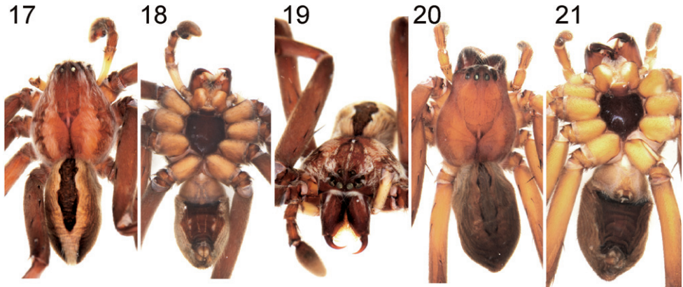
Figures 17–21. Palystes kreutzmanni sp. n. from South Africa, Western Cape Province, Kleinmond (17–19 Holotype male, PJ 3261 20–21 Paratype female, PJ 3263).

preceding specimen except for DK 52, SD 229–230 (PPRI). 1 female (PJ 3264), same data as for preceding specimen except for DK 53, SD 231–232 (SMF). 1 female (PJ 3263), same data as for preceding specimen except for DK 51, SD 2226–227 (SMF). 1 female (PJ 3267), same data as for preceding specimen except for S 34°20.129', E 18°58.532', 192 m altitude, DK 47, SD 228 (SMF).