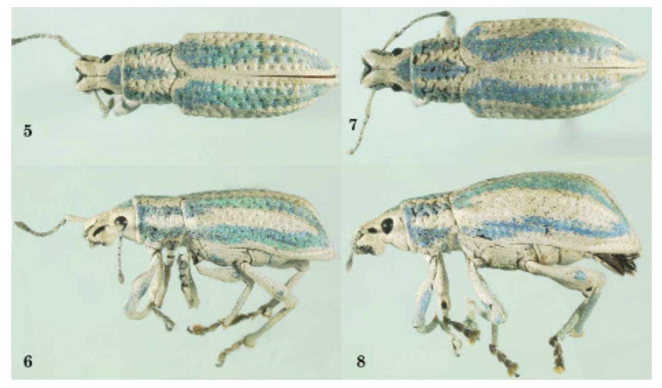
Figures 5–8. Habitus. 5) C. viridivittatus -male dorsal. 6) C. viridivittatus -male lateral. 7) C. viridivittatus -female dorsal. 8) C. viridivittatus -female lateral.

convex apically; sternum II strongly, transversely convex; sternum V narrowly, weakly, longitudinally convex along midline. Genitalia : Sternum VIII with plate elongate, sclerotized arms narrow, apically subtruncate, narrowly membranous between arms for entire length of plate. Spermatheca C-shaped, cornu slightly turned upward, ramus directed dorsally. Length, pronotum and elytron: 11.50mm. Length, head and rostrum: 2.80mm. Total length: 14.30mm.