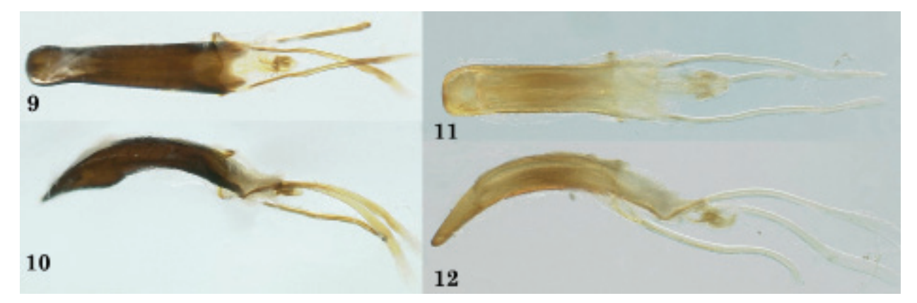
Figures 9–12. Male median Lobe. 9) C. obliquatus–dorsal. 10) C. obliquatus–lateral. 11) C. viridivittatus–dorsal. 12) C. viridivittatus–lateral.