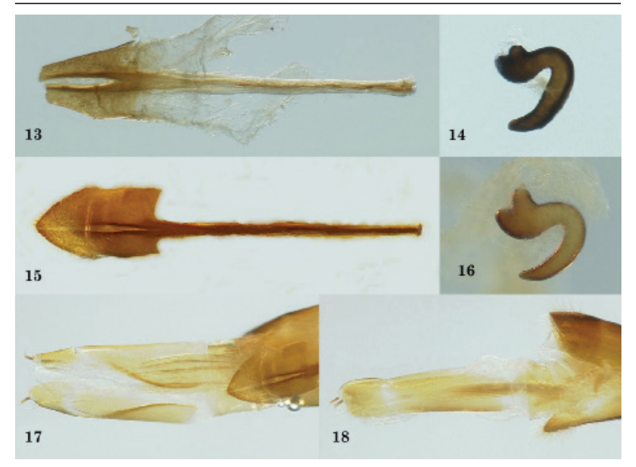
Figures 13–18. Female genitalia. 13) C. obliquatus-sternum VIII. 14) C. obliquatus-spermatheca. 15) C. viridivittatus-sternum VIII. 16) C. viridivittatus-spermatheca. 17) C. viridivittatus-ovipositor, dorsal view. 18) C. viridivittatus-ovipositor, lateral view.