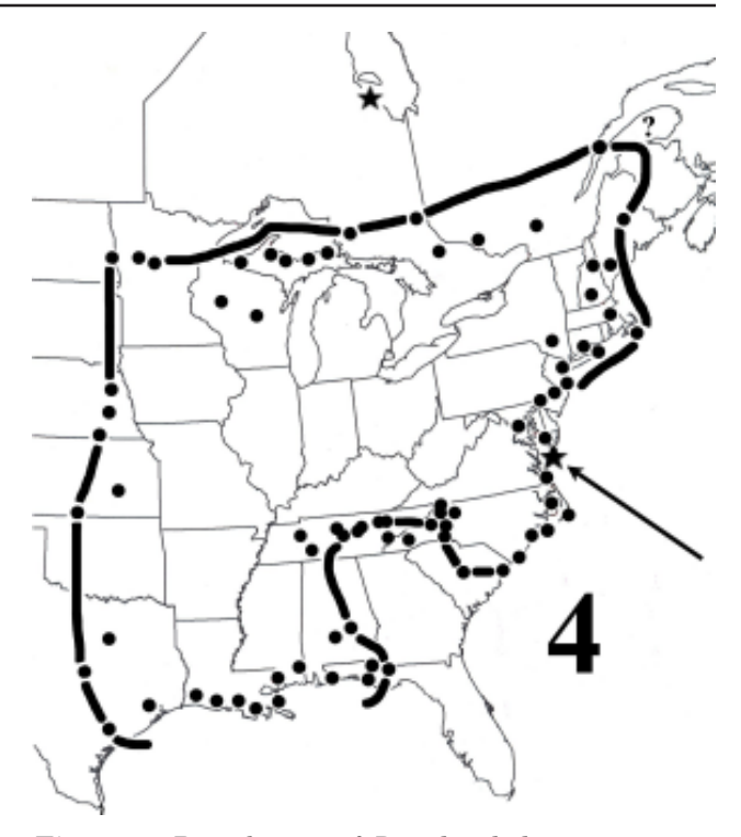
Figure 4. Distribution of Pseudopolydesmus serratus showing peripheral localities. Upper star, type locality of Polydesmus canadensis Newport, 1844, type-species of Pseudopolydesmus ; Lower Star, denoted by the arrow, approximate type locality of Polydesmus serratus Say, 1821, on the Eastern Shore of Virginia.

distances into the Central Plains (Keeton 1960; Shelley 1980, 1994; Hoffman 1999; McAllister et al. 2005; Shelley and McAllister 2007; Shelley et al. 2003, 2005, 2006) as does Pseudopolydesmus serratus (Fig. 3). Ranging eastward to the Atlantic Ocean and even inhabiting offshore islands -Nantucket, Massachusetts; Gardiners, New York (in Gardiners Bay at the eastern end of Long Island); and Hatteras, North Carolina Pseudopolydesmus serratus extends, north/south, from the Gaspé Peninsula, Québec, the Upper Peninsula (UP) of Michigan/adjacent Ontario, and the latitude of Fargo to Matagorda Bay, Texas, the Gulf Coast from Louisiana to east of the Apalachicola River in the Florida Panhandle, and central South Carolina. Dimensions vary from 1,139-2,278 km (712-1,424 mi), east/west, and 1,402-1,986 km (876-1,241 mi), north/south. As noted by Hoffman (1999), the species has never been taken in, and is apparently absent from, the southeastern Coastal Plain south of Myrtle Beach, South Carolina, including peninsular Florida, and the entire state of Georgia, though it may occur in the southwestern corner (Seminole and Decatur cos.); occurrence cannot even be demonstrated in the southern Blue Ridge Physiographic Province of north Georgia, where the genus is common. The occupied area covers parts of three Canadian Provinces (Ontario, Québec, and New Brunswick), 36 US states plus the District of Columbia, and all of