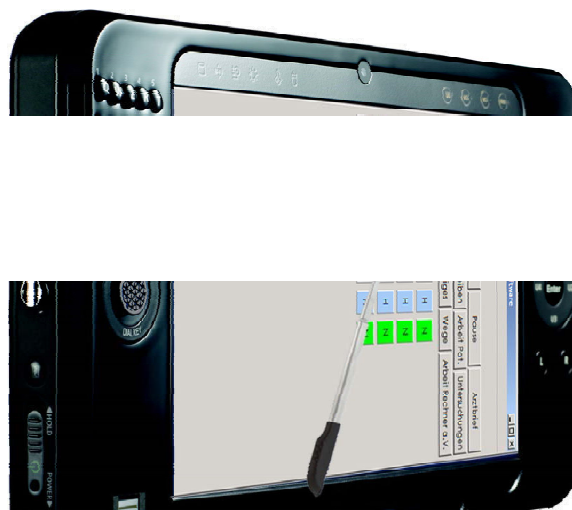
Figure 1 Ultra mobile PC.

The developed software was implemented in an Ultra mobile PC (UMPC). An UMPC is a small handheld laptop with a pressure-sensitive screen (see figure 1). It measures