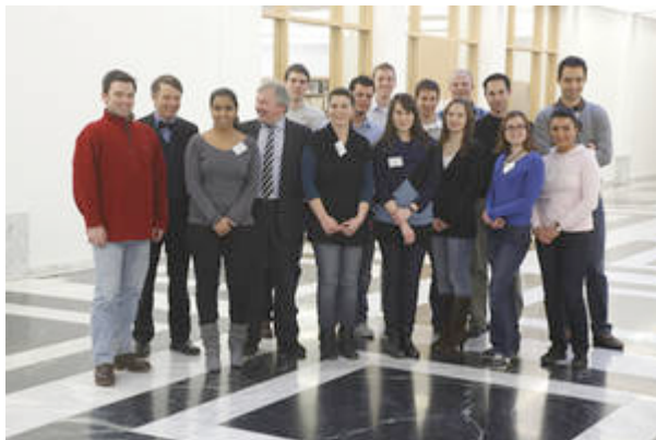
Students of all programs were invited to meet with the Peer Review Team

As one of the first German faculties of economics and business our Faculty had subjected itself successfully to the accreditation procedure of AACSB International (Association to Advance Collegiate Schools of Business), which requires a periodical reaccreditation process every five years. Early April the good news about reaccreditation reached the Dean's office.