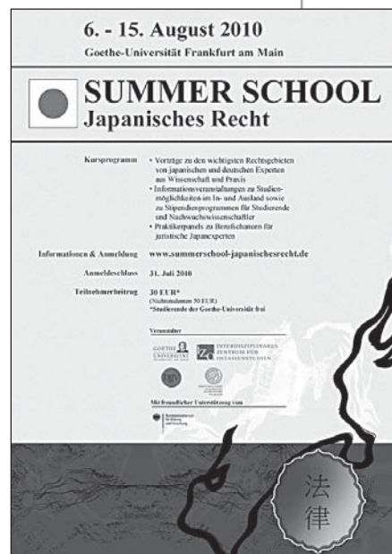
First Frankfurt summer school for Japanese law, August 2010