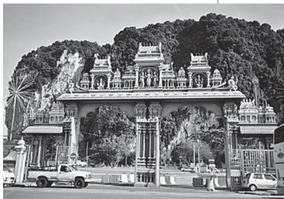
Batu Caves, Malaysia