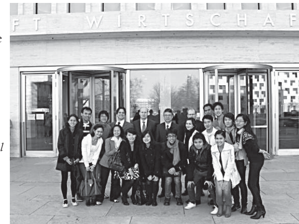
Participants in the Spring School on German Law for students of Thammasat University in April 2010 – pictured in the middle is the Thai Consul General