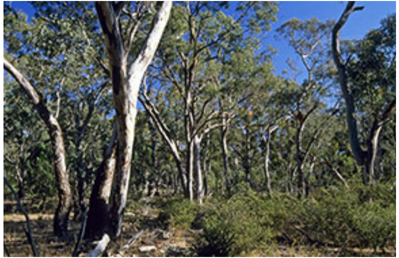
Photo 2: ID278b_PC174-16.jpg Eucalyptus blakelyi - E.goniocalyx riparian woodland with Gahnia aspera ground cover. Conimbla National Park, [AGD66 33°48'40"S 148°26'50"E], 11/10/02, Jaime Plaza.

Photo 1: ID278a_PC248-16.jpg Eucalyptus blakelyi valley sedge-grass woodland with Acacia paradoxa shrubs in Goobang NP, Spring Creek Trail, [AGD66 32°57'23"S 148°25'16.9"E], 04/05/2005, Jaime Plaza.