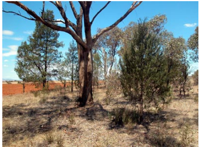
Photo 3: ID267c_PC253-24.jpg Eucalyptus albens - Callitris glaucophylla woodland, Tanners Spring Road, [AGD66 32°33'50"S 148°21'55.9"E], 5/05/2005.

Photo 2: ID267b_benson.jpg Eucalyptus albens with Callitris glaucophylla on red parna soils, roadside south of Temora, lower slopes sub-region of NSW SWS Bioregion, February 2007.