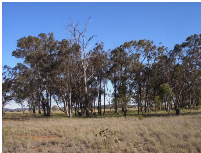
Photo 1: ID248a_DIPNR.jpg Mixed woodland of central NSW with Eucalyptus microcarpa , Eucalyptus populnea ; Steve Lewer 2002, DIPNR Dubbo.

Characteristic Vegetation: (Quantitative Data)