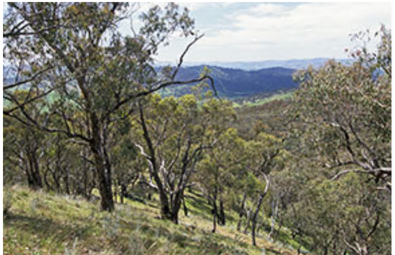
Photo 3: ID316c_DX28720.jpg Heavily grazed Norton's Box ( Eucalyptus nortonii ) - Red Box ( Eucalyptus polyanthemos ) open forest with a rich forb-grass ground cover on Crown Land on Yarch Road Darlow Creek near Adelong, [AGD66 35°20.488'S 147°57.540'E], 6/5/2006, Jaime Plaza.

Photo 2: ID316b_PC194-18.jpg Eucalyptus nortonii - Eucalyptus polyanthemos grass - forb woodland in Minjary National Park, [AGD66 35°13'39"S 148°07'33"E], 16/10/02, Jaime Plaza.