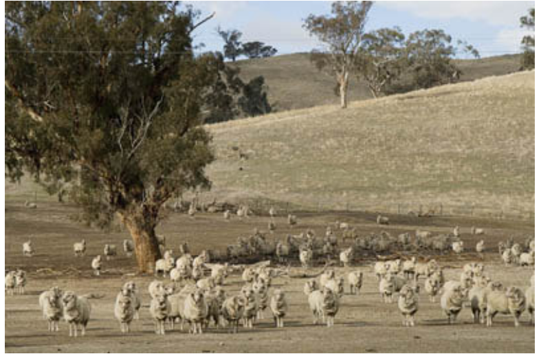
Photo 3: ID276c_PC261-21.jpg Eucalyptus melliodora woodland on flats near Nubingerie, West of Wellington, [AGD66 32°31'22.7"S 148°40'15.8"E], 08/05/2005, Jaime Plaza.

Photo 2: ID276b_DX27763.jpg Yellow Box woodland on alluvial flats south of Jugiong grading into Eucalyptus blakelyi (ID277) on hills in the background, [AGD66 34°54.298'S 148°19.100'E], 29/04/2006, Jaime Plaza.