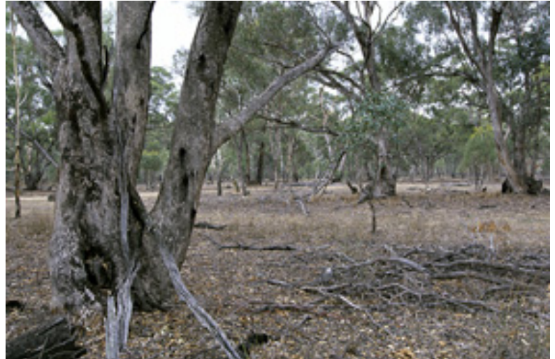
Photo 3: ID237c_img382ps.jpg Western Grey Box ( Eucalyptus microcarpa ) open-forest in Ulupna Island Flora and Fauna Reserve (north of Strathmerton), Reserve Track, approx. 1.4 km from junction of Ulupna Creek and River Murray, Victoria; 14/11/1987, Peter Smith.

Photo 2: ID237b_img022pc.jpg Eucalyptus microcarpa woodland, Millewa State Forest, [AGD66 35°48'17.3"S 145°08'48.1"E], 10/4/02, Jaime Plaza.