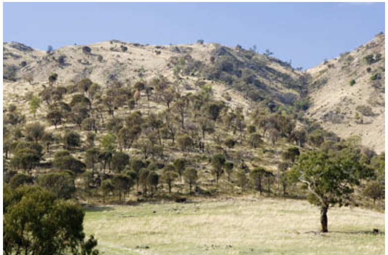
Photo 3: ID301c_DX27815.jpg Allocasuarina verticillata with Acacia decora and Ricinocarpus bowmannii on hill slope on Coolac serpentinite above Brungle Gap, [AGD66 35°12.033'S 148°21.257'E], 29/4/2006, Jaime Plaza.

Photo 2: ID301b_DX28732.jpg Drooping Sheoak ( Allocasuarina verticillata ) shrubland on Coolac serpentinite showing boundary with non-serpentinite substrate at the base of the hill, Honeysuckle Range near Brungle [AGD66 35°07.998'S 148°17.91'E], 7/5/2006, Jaime Plaza.