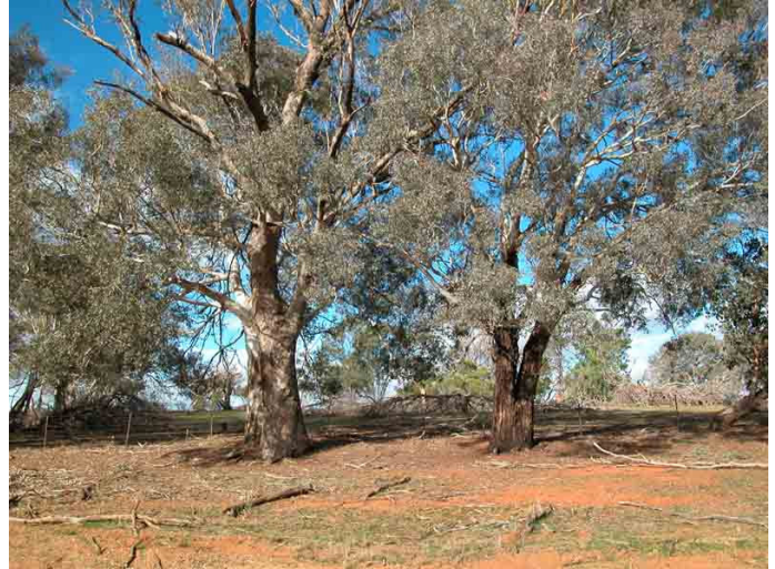
Photo 2: ID426b_benson DSCN0016.jpg Isolated Red Box ( Eucalyptus polyanthemos ) tree in a cleared paddock north of Cootamundra in the south western slopes, [AGD66 34°57'25.3"S 148°03'13.5"E], 22/5/2009, J.S. Benson.

Photo 1: ID426a_benson DSCN0011.jpg Red Box ( Eucalyptus polyanthemos ) - White Box ( Eucalyptus albens ) woodland on a roadside north of Cootamundra in the south western slopes, [AGD66 34°56'24.7"S 148°03'11.1"E], 22/5/2009, J.S. Benson.