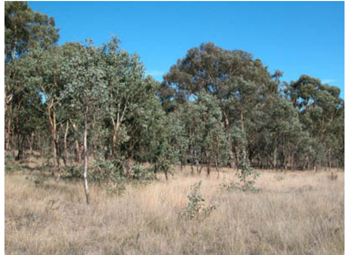
Photo 3: ID282c_PC179-16.jpg Eucalyptus blakelyi - E. melliodora - Callitris endlicheri woodland, Koorawatha Cemetery [AGD66 34°03'08"S 148°33'10"E], 12/10/02, Jaime Plaza.

Photo 2: ID282b_benson.jpg Eucalyptus blakelyi regrowth with Lissanthe strigosa and Aristida ramosa on rolling hills in Dananbilla Nature Reserve near Young, [AGD66 34°10.179'S 148°33.714'E], 13/23/2007, J.S. Benson.