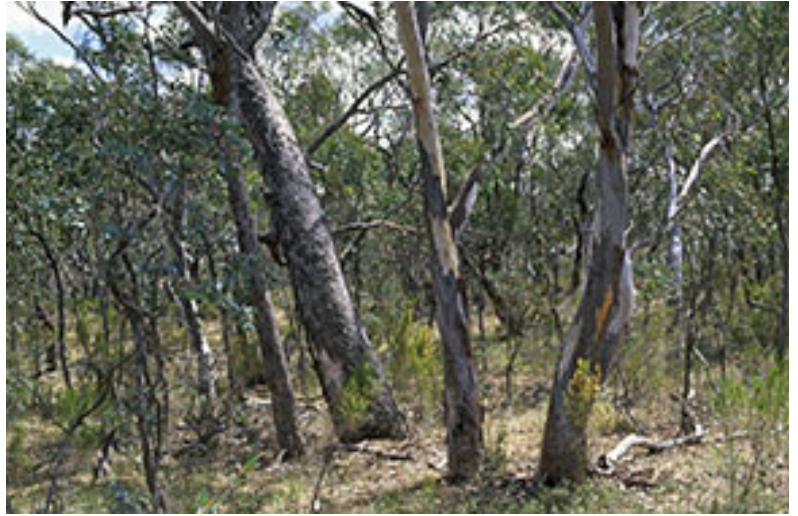
Photo 2: ID280b_PC184-14.jpg The tall shrub Acacia baileyana in Eucalyptus gonicalyx - E. blakelyi woodland on the Stockinbingal - Cootamundra Road, [AGD66 34°33'32"S 147°58'11"E], 14/10/02, Jaime Plaza.

Photo 1: ID280a_PC184-19.jpg Eucalyptus gonicalyx - E. blakelyi shrub - grass woodland on hills on the Temora - Cootamundra Road, [AGD66 34°33'32"S 147°58'11"E], 14/10/02, Jaime Plaza.