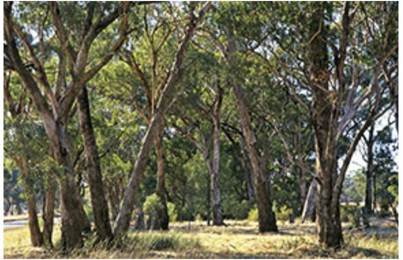
Photo 2: ID76b_benson.jpg Eucalyptus microcarpa tall woodland grazed in drought, Morangarell Road near Narraburra north of Temora [AGD66 34°15.568'S 147°47.251'E], 14/2/2007, J.S. Benson.

Photo 1: ID76a_PC248-9.jpg Eucalyptus microcarpa - Callitris glaucophylla tall woodland, Parkes to Wellington Road near Hervey Range, [AGD66 32°59'47"S 148°21'19"E], 04/05/2005, Jaime Plaza.