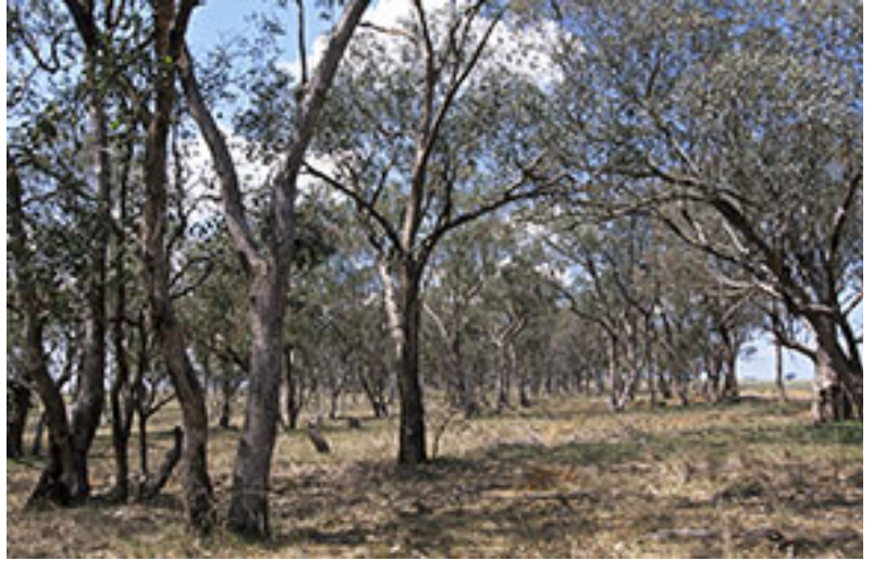
Photo 2: ID266b_PC172-12.jpg Eucalyptus albens - Themeda australis grassy woodland, Canowindra Cemetery, [AGD66 33°32'59"S 148°40'17"E], 10/10/02, Jaime Plaza.

Photo 1: ID266a_PC178-22.jpg Eucalyptus albens grassy woodland, Quamby-Thuddungra TSR south of Grenfell, [AGD66 34°09'28"S 148°08'39"E], 12/10/02, Jaime Plaza.