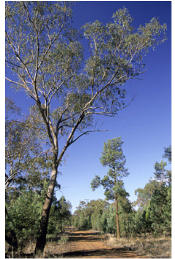
Photo 3: ID82c_Ballestrin.jpg Eucalyptus microcarpa - E. populnea - Callitris glaucophylla woodland, Woolshed section of Cocoparra National Park, 21/10/2004, M. Ballestrin.

Photo 2: ID82b_img143pc.jpg Eucalyptus microcarpa - Callitris glaucophylla woodland, north of Rankins Springs, [AGD66 33°48'41.4"S 146°17'57.2"E], 18/4/02, Jaime Plaza.