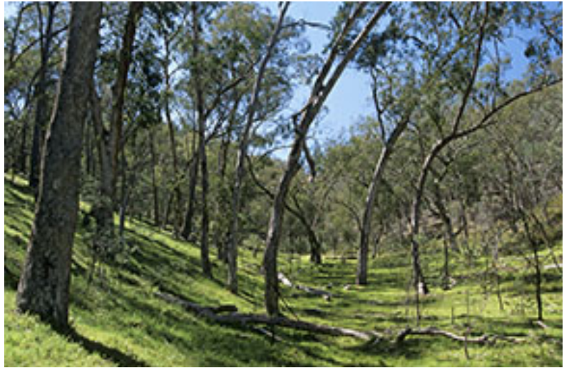
Photo 2: ID283b_PC188-10.jpg Eucalyptus albens - E. brigesiana - E. blakelyi herbaceous grassy gully woodland, Livingstone National Park, [AGD66 35°20'50"S 147°20'42"E], 15/10/02, Jaime Plaza.

Photo 1: ID283a_PC208-3.jpg Eucalyptus bridgesiana - Acacia dealbata gully herbaceous woodland in Ellerslie Nature Reserve, [AGD66 35°14'33"S 147°51'30"E], 20/10/02, Jaime Plaza.