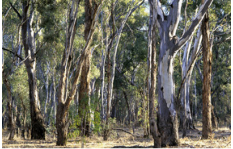
Photo 2: ID74b_img032pc.jpg Eucalyptus melliodora - E.camaldulensis woodland, Millewa State Forest, [AGD66 35°47'28.0"S 145°01'47.9"E], 10/4/02, Jaime Plaza.

Photo 1: ID74a_img031pc.jpg Eucalyptus melliodora - E.camaldulensis woodland, Millewa State Forest, [AGD66 35°47'28.0"S 145°01'47.9"E], 10/4/02, Jaime Plaza.