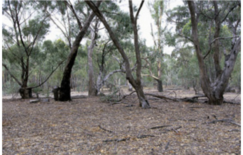
Photo 2: ID237b_img022pc.jpg Eucalyptus microcarpa woodland, Millewa State Forest, [AGD66 35°48'17.3"S 145°08'48.1"E], 10/4/02, Jaime Plaza.

Photo 1: ID237a_img021pc.jpg Eucalyptus microcarpa woodland, Millewa State Forest, [AGD66 35°48'17.3"S 145°08'48.1"E], 10/4/02, Jaime Plaza.