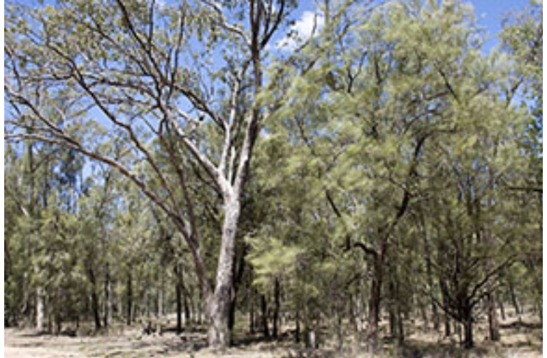
Photo 2: ID56b_dsc_1773.jpg Eucalyptus populnea - Casuarina cristata woodland, Merri Merri Creek, [AGD66 31°14'46"S 148°13'10"E], 17/8/03, Jaime Plaza.

Photo 1: ID56a_BBS NOV 2007 0073.jpg Eucalyptus populnea - Casuarina cristata woodland on alluvial plains, Croppa Road north-east of Moree, [AGD66 29°14'49.1"S 150°11'22.7"E], 13/11/2008, Jaime Plaza.