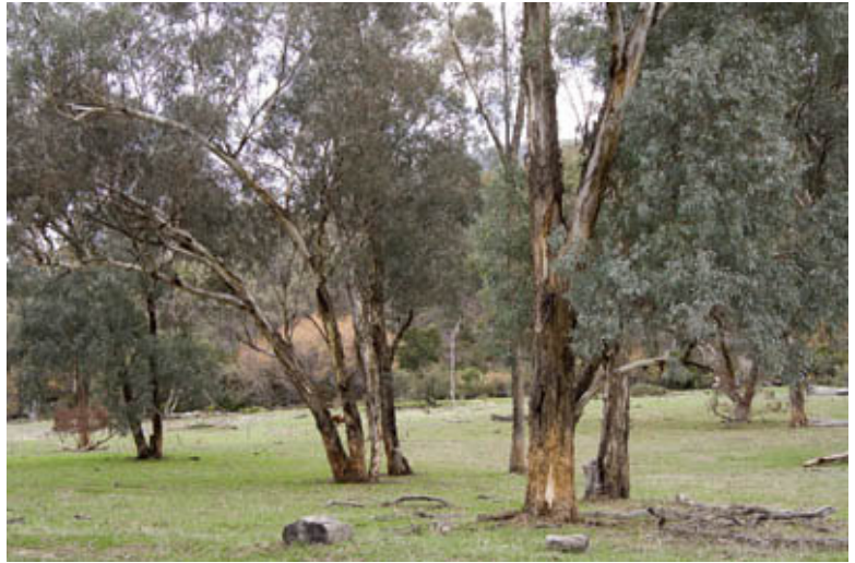
Photo 1: ID312a_DX28629.jpg Yellow Box ( Eucalyptus melliodora ) tall woodland with an altered grassy ground cover along the lower reaches of Tumberumba Creek in the upper Murray River region, [AGD66 35°53.380'S 148°03.439'E], 5/5/2006, Jaime Plaza.

Characteristic Vegetation: (Quantitative Data)