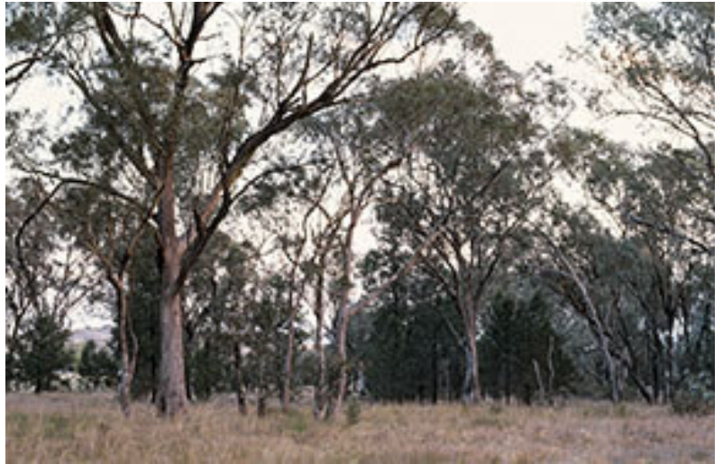
Photo 3: ID266c_PC193-12.jpg Eucalyptus albens grassy woodland, Minjary National Park, [AGD66 35°13'18"S 148°07'20"E], 16/10/02, Jaime Plaza.

Photo 2: ID266b_PC172-12.jpg Eucalyptus albens - Themeda australis grassy woodland, Canowindra Cemetery, [AGD66 33°32'59"S 148°40'17"E], 10/10/02, Jaime Plaza.