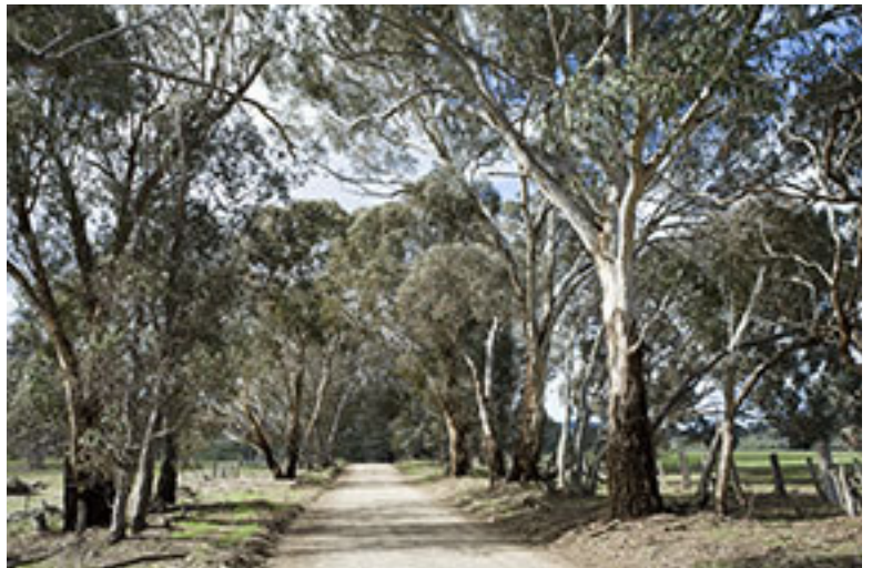
Photo 3: ID277c_PC262-6.jpg Eucalyptus melliodora - E. blakelyi grassy woodland on the Yeoval-Cumnock Road, [AGD66 32°53'26.6"S 148°44'12.1"E], 8/05/2005, Jaime Plaza.

Photo 2: ID277b_SWS0507093.jpg Blakely's Red Gum ( Eucalyptus blakelyi ) - Yellow Box ( Eucalyptus melliodora ) woodland on light brown soils along High Rock Road east of Rye Park, [AGD66 34°32.025'S 148°55.483'E], 29/5/2007, Jaime Plaza.