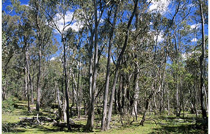
Photo 2: ID284b_PC197-20.jpg Eucalyptus blakelyi - Leptospermum contienale valley flat swampy woodland in Murragulrie Flora Reserve, [AGD66 35°29'44"S 147°37'54"E], 17/10/02, Jaime Plaza.

Photo 1: ID284a_PC197-19.jpg Eucalyptus blakelyi herbaceous - tea tree valley flat swampy woodland in Murragulrie Flora Reserve, [AGD66 35°29'44"S 147°37'54"E], 17/10/02, Jaime Plaza.