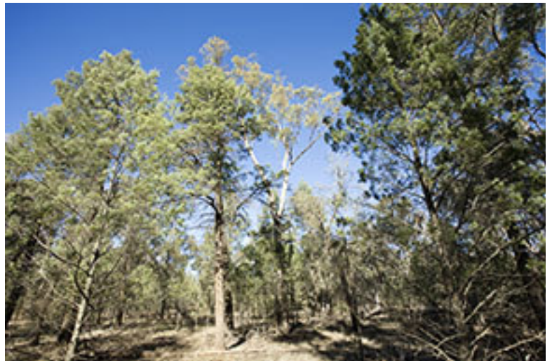
Photo 3: ID80c_img009pc.jpg Eucalyptus microcarpa - Callitris glaucophylla woodland, Buckingbong Flora Reserve, [AGD66 34°59'12.9"S 146°28'59.4"E], 9/4/02, Jaime Plaza.

Photo 2: ID80b_SWS0507342.jpg Western Grey Box ( Eucalyptus microcarpa ) with ( Callitris glaucophylla ) and Buloke ( Allocasuarina luehmannii ) in Clear Ridge State Forest north of Wyalong, [AGD66 33°45.220'S 147°18.992'E], 31/5/2007, Jaime Plaza.