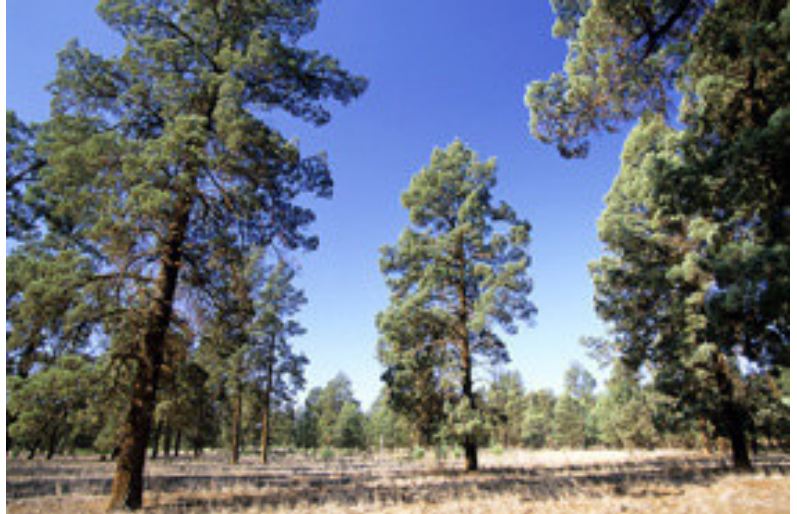
Photo 2: ID70b_img152pc.jpg Callitris glaucophylla /Acacia deanei subsp. deanei woodland Back Creek State Forest, [AGD66 33°52'24.8"S 147°21'46.6"E], 19/4/02, Jaime Plaza.

Photo 1: ID70a_img141pc.jpg Callitris glaucophylla woodland, Hillston-Rankins Springs Rd, [AGD66 33°42'30.3"S 146°02'36.0"E], 18/4/02, Jaime Plaza.