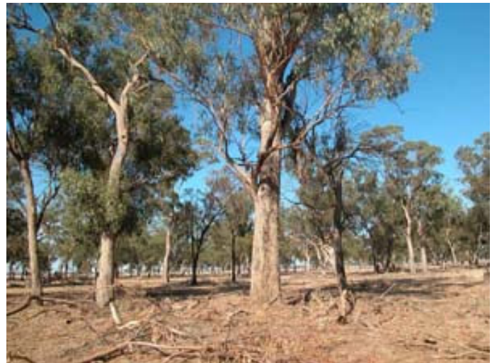
Photo 3: ID76c_img295pc.jpg Eucalyptus microcarpa grassy tall woodland on loamy clay, Bimbi Road TSR South of Grenfell, [AGD66 34°01'09"S 147°50'13"E], 12/10/02, Jaime Plaza.

Photo 2: ID76b_benson.jpg Eucalyptus microcarpa tall woodland grazed in drought, Morangarell Road near Narraburra north of Temora [AGD66 34°15.568'S 147°47.251'E], 14/2/2007, J.S. Benson.