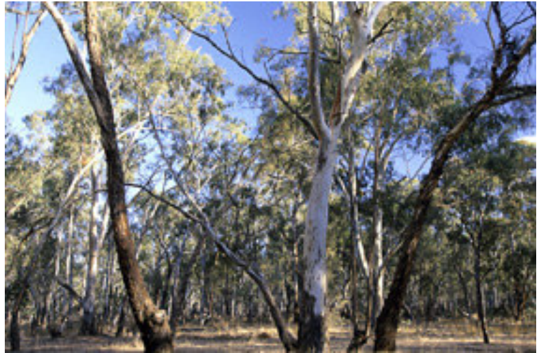
Photo 3: ID74c_img381ps.jpg Eucalyptus melliodora woodland with the exotic grass Bromus diandrus dominating the ground. Northern side of Lake Mulwala, approx.7 km east of Mulwala; 17/11/1987, Peter Smith.

Photo 2: ID74b_img032pc.jpg Eucalyptus melliodora - E.camaldulensis woodland, Millewa State Forest, [AGD66 35°47'28.0"S 145°01'47.9"E], 10/4/02, Jaime Plaza.