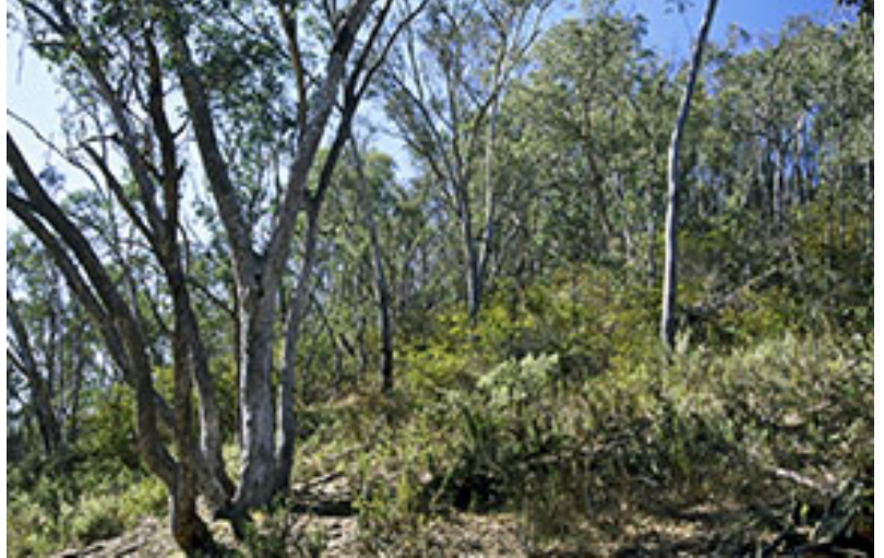
Photo 2: ID268b_SWS0507002.jpg White Box ( Eucalyptus albens ) open forest with Red Stringybark ( Eucalyptus macrorhyncha ), Blakely's Red Gum ( Eucalyptus blakelyi ) and the shrub Acacia genistifolia in Wyangala State Recreation Area, [AGD66 33°54.149'S 149°00.117'E], 1/6/2007, Jaime Plaza.

Photo 1: ID268a_PC207-2.jpg Eucalyptus albens - E. blakelyi - E. macrorhyncha shrubby hillslope woodland in Ellerslie Nature Reserve, [AGD66 35°13'34"S 147°52'13"E], 20/10/02, Jaime Plaza.