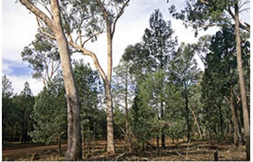
Photo 2: ID80b_SWS0507342.jpg Western Grey Box ( Eucalyptus microcarpa ) with ( Callitris glaucophylla ) and Buloke ( Allocasuarina luehmannii ) in Clear Ridge State Forest north of Wyalong, [AGD66 33°45.220'S 147°18.992'E], 31/5/2007, Jaime Plaza.

Photo 1: ID80a_PC247-12.jpg Eucalyptus microcarpa - Callitris glaucophylla woodland, Backyamma State Forest, [AGD66 33°19'28.3"S 148°12'56.2"E], 03/05/2005, Jaime Plaza.