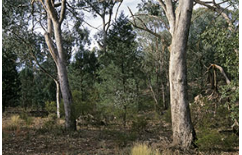
Photo 2: ID267b_benson.jpg Eucalyptus albens with Callitris glaucophylla on red parna soils, roadside south of Temora, lower slopes sub-region of NSW SWS Bioregion, February 2007, J.S. Benson.

Photo 1: ID267a_PC247-7.jpg Eucalyptus albens - Callitris glaucophylla open forest on a low hill on Backgamma Road, near Parkes, [AGD66 33°17'13.8"S 148°15'47.1"E], 03/05/2005, Jaime Plaza.