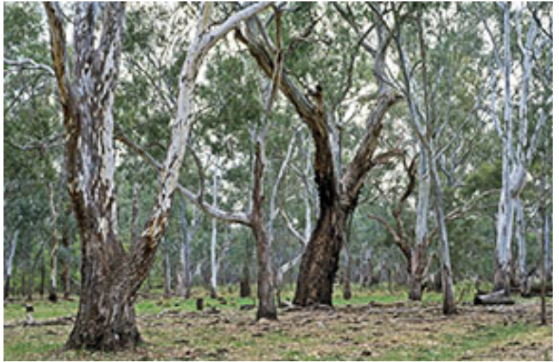
Photo 2: ID277b_SWS0507093.jpg Blakely's Red Gum ( Eucalyptus blakelyi ) - Yellow Box ( Eucalyptus melliodora ) woodland on light brown soils along High Rock Road east of Rye Park, [AGD66 34°32.025'S 148°55.483'E], 29/5/2007, Jaime Plaza.

Photo 1: ID277a_PC171-11.jpg Yellow Box ( Eucalyptus melliodora ) - Blakely's Red Gum ( E. blakelyi ) tall woodland, on flats near Forbes [AGD66 33°24'37"S 148°11'23"E], 10/10/02, Jaime Plaza.