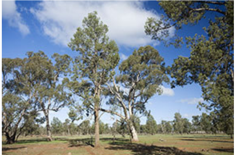
Photo 2: ID82b_img143pc.jpg Eucalyptus microcarpa - Callitris glaucophylla woodland, north of Rankins Springs, [AGD66 33°48'41.4"S 146°17'57.2"E], 18/4/02, Jaime Plaza.

Photo 1: ID82a_SWS0507400.jpg Poplar Box ( Eucalyptus populnea ) - Western Grey Box ( Eucalyptus microcarpa ) - White Cypress Pine ( Callitris glaucophylla ) open woodland on red loam soil west of Lake Cowal, central NSW, [AGD66 33°33.270'S 147°22.272'E], 31/5/2007, Jaime Plaza.