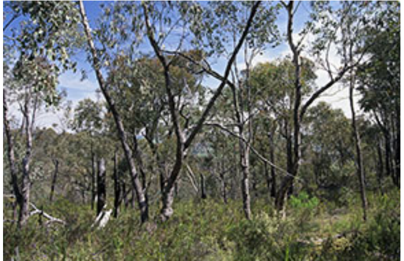
Photo 2: ID316b_PC194-18.jpg Eucalyptus nortonii - Eucalyptus polyanthemos grass - forb woodland in Minjary National Park, [AGD66 35°13'39"S 148°07'33"E], 16/10/02, Jaime Plaza.

Photo 1: ID316a_PC194-20.jpg Eucalyptus nortonii - E. macrorhyncha - E. polyanthemos - Stypandra glauca woodland on hillcrests in Minjary National Park, [AGD66 35°14'31"S 148°07'34"E], 16/10/02, Jaime Plaza.