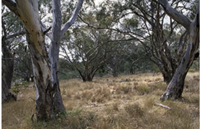
Photo 2: ID282b_benson.jpg Eucalyptus blakelyi regrowth with Lissanthe strigosa and Aristida ramosa on rolling hills in Dananbilla Nature Reserve near Young, [AGD66 34°10.179'S 148°33.714'E], 13/23/2007, J.S. Benson.

Photo 1: ID282a_PC187-16.jpg Eucalyptus blakelyi grassy hill woodland, south of Wagga Wagga, [AGD66 35°14'22"S 147°19'55"E], 15/10/02, Jaime Plaza.