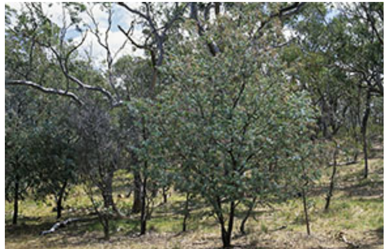
Photo 3: ID280c_DX27774.jpg Eucalyptus gonicalyx - E. blakelyi - E. melliodora - E. macrorhyncha open forest on a ridge on Adjunbilly Road south of Jugiong, SW Slopes, [AGD66 35°03.746'S 148°20.115'E], 29/4/2006, Jaime Plaza.

Photo 2: ID280b_PC184-14.jpg The tall shrub Acacia baileyana in Eucalyptus gonicalyx - E. blakelyi woodland on the Stockinbingal - Cootamundra Road, [AGD66 34°33'32"S 147°58'11"E], 14/10/02, Jaime Plaza.