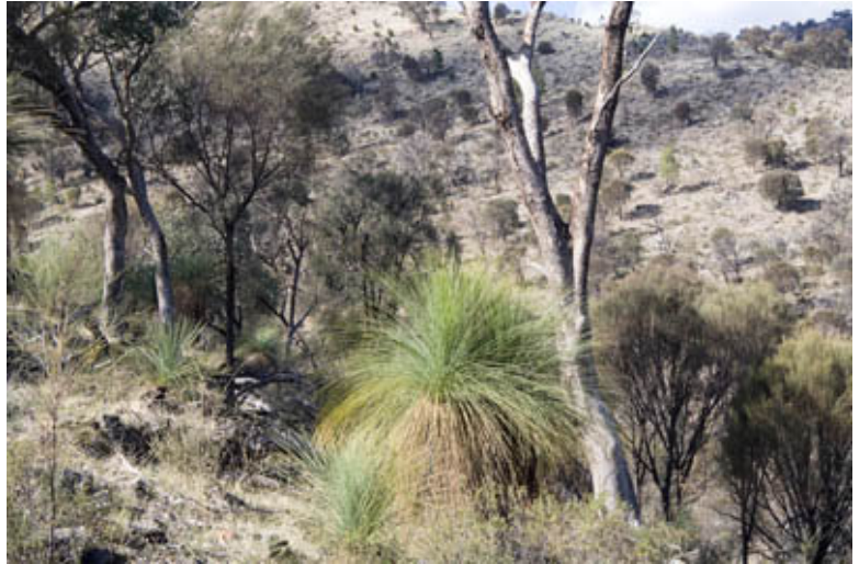
Photo 2: ID301b_DX28732.jpg Drooping Sheoak ( Allocasuarina verticillata ) shrubland on Coolac serpentinite showing boundary with non-serpentinite substrate at the base of the hill, Honeysuckle Range near Brungle [AGD66 35°07.998'S 148°17.91'E], 7/5/2006, Jaime Plaza.

Photo 1: ID301a_DX28770.jpg Allocasuarina verticillata , Eucalyptus nortonii , Xanthorrhoea glauca subsp. angustifolia , Ricinocarpus bowmannii tall shrubland on Coolac serpentinite near Brungle, [AGD66 35°07.734'S 148°17.996'E], 7/5/2006, Jaime Plaza.