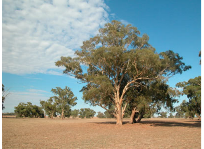
Photo 2: ID276b_DX27763.jpg Yellow Box woodland on alluvial flats south of Jugiong grading into Eucalyptus blakelyi (ID277) on hills in the background, [AGD66 34°54.298'S 148°19.100'E], 29/04/2006, Jaime Plaza.

Photo 1: ID276a_benson.jpg Yellow Box woodland on red loam and alluvium north of Junee, 14/03/2007, J.S. Benson.