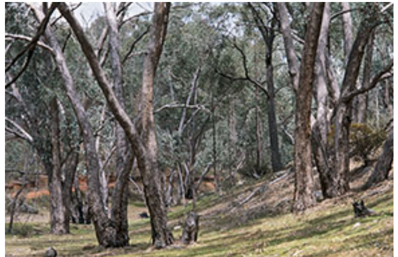
Photo 3: ID283c_PC192-3.jpg Eucalyptus bridgesiana - E. melliodora valley woodland on the Little Billabong - Tumbarumba Road, [AGD66 35°33'20"S 147°37'02"E], 15/10/02, Jaime Plaza.

Photo 2: ID283b_PC188-10.jpg Eucalyptus albens - E. brigesiana - E. blakelyi herbaceous grassy gully woodland, Livingstone National Park, [AGD66 35°20'50"S 147°20'42"E], 15/10/02, Jaime Plaza.