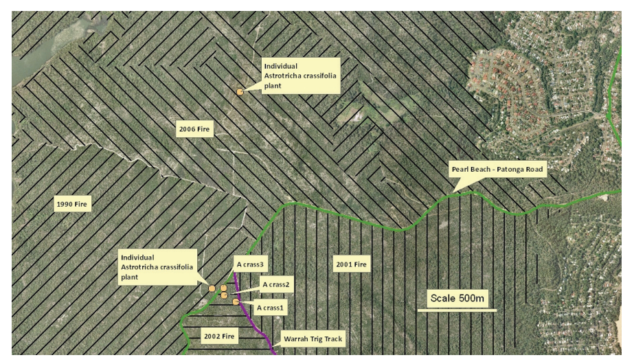
Fig. 1. Aerial view of the Waratah Patch in Brisbane Water National Park showing subpopulations of Astrotricha crassifolia in 2004, and area of burns in 2001, 2002 and 2006.

National Park, between Pearl Beach and Patonga, about 80 km north of Sydney (Figure 1). Another two occurrences at the Waratah Patch, each consisting of a single plant, were not included in this study. In this survey, the term subpopulation has been used to describe discrete patches; however it is unclear whether or not the patches are of common clonal origin.