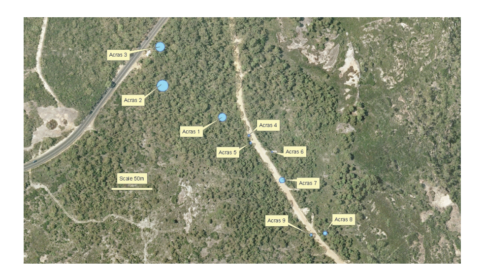
Fig. 2. Location of nine subpopulations of Astrotricha crassifolia recorded in 2010, Brisbane Water National Park.

The maximum perimeter length (43m) for Acras2 , the largest subpopulation, equates to a patch diameter of 13.7m, suggesting an area of occupancy of 147m<sup>2</sup> and stem density of 3.4 stems/m<sup>2</sup> (Table 2). Using these approximate diameters, stem densities for all patches calculated to between 1 and 25 stems per m<sup>2</sup> (Table 2). The total area of occupancy of the Astrotricha crassifolia metapopulation in the Gosford LGA is 385m<sup>2</sup>, this figure being an aggregate of all subpopulations. (Surveying the subpopulations took about 32 hours.)