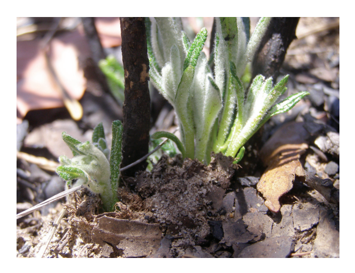
Fig. 7. Response to hazard reduction burn, Astrotricha crassifolia resprouting in November 2011, Brisbane Water National Park.

The NSW Office of Environment & Heritage website (OEH 2011 2) indicates inappropriate fire regimes are a threat to the species, though the NSW National Parks and Wildlife Fire Response Database (NSW NPWS 2002) indicates there are not enough data to inform an appropriate fire regime for the species. The 2004 Census and our current work have increased knowledge of the species response to fire. Park fire management needs to ensure an appropriate regime is maintained. Knowledge of this plant's response to fire is crucial given the significance of the Waratah Patch to local tourism (Beckers & Offord 2010) and to reduce competing priorities for Waratah and fuel management. As this paper goes to press we can document the plant's response to a hazard reduction burn (on 22/9/2011) on the eastern side of Warrah Trig track, in the vicinity of subpopulations (Acras 6,7,8). On 11/11/2011, no true seedlings were observed but Astrotricha crassifolia resprouts were emerging from the soil at the base of burnt stems (Figure 7).