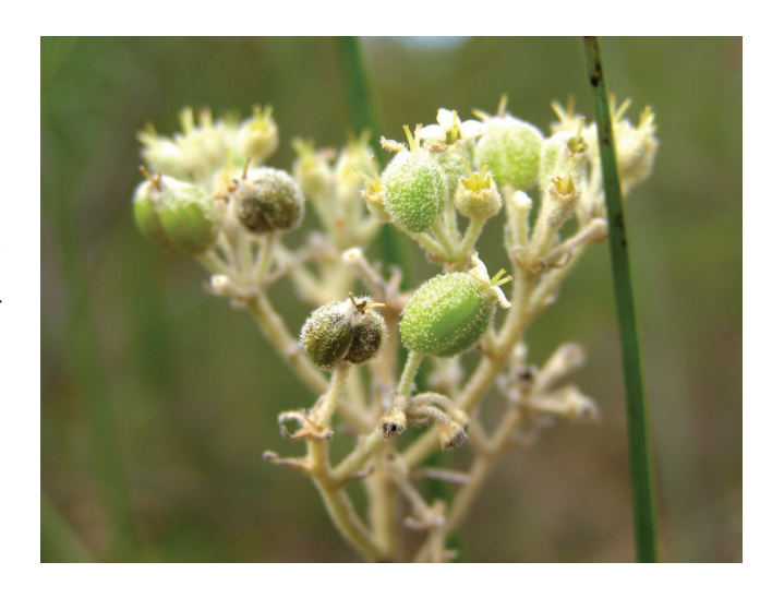
Fig. 8. Mature fruit of Astrotricha crassifolia , Brisbane Water National Park, 7 Dec 2010.

High frequency fire is considered a key threatening process to many plants, but Gross (2006) identifies that the literature on clonality, implies frequent fire may which favour clonal species. There may however be serious longterm implications in clonal plants with the loss of sexual reproduction e.g. clonality may induce a cascade of events leading to sexual extinction and finally complete genetic homogenization (Honnay et al. 2006), and susceptibility to pathogens and disease (Schmid 1994). However, despite the limitations, evidence of extraordinary ages of clones, e.g. Eucalyptus recurva, a mallee eucalypt may have survived up to 13,000 years without sexual reproduction (NPWS 2003), means that being a clone may provide an alternative survival strategy. While we cannot confirm clonality in Astrotricha crassifolia, its localised patches of stems and the absence of evidence of true seedlings warrants the question as to whether the subpopulations are in fact clones.