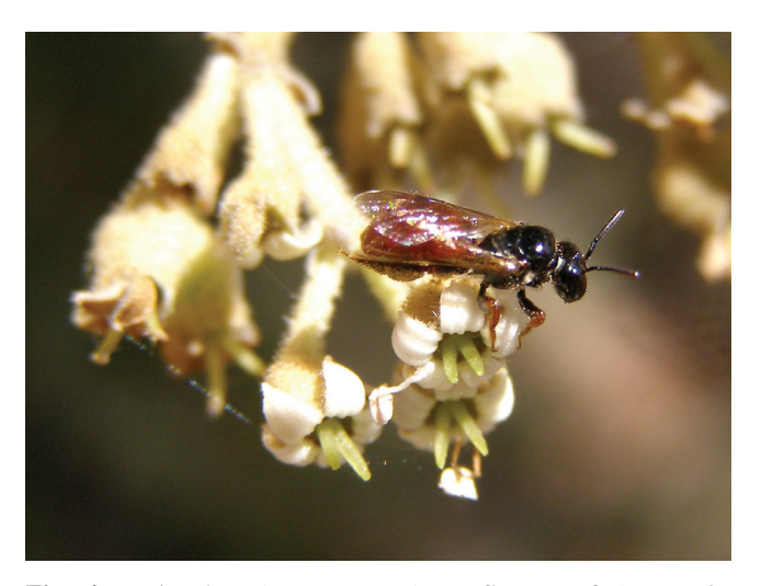
Fig. 4. Native bee ( Exoneura sp.) on flowers of Astrotricha crassifolia.

Resprouting from basal vegetative material, the recruitment strategy indicated in Benson & McDougall (1993), enabled Astrotricha crassifolia to recover from slashing for roadside maintenance. Very few stems were observed in the 0–10cm height category (Figure 3); what appeared to be seedlings in the leaf mulch were often found to be the vertical light-seeking shoots of collapsed branches.