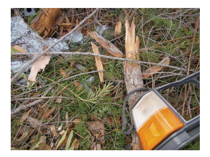
Fig. 5. Astrotricha crassifolia affected by vehicular damage along Warrah Trig Track. (Photo D. Warman).

from the unsealed Warrah Trig track, slashing, effects of runoff, and microclimatic changes due to sedimentation traps, edge effects and vehicular damage (Figure 5). The subpopulations directly adjacent to Warrah Trig track may have been fragmented during the original construction of the road, which may also have resulted in the loss of some plants. Illegal rubbish dumping occurs regularly in the area and during this survey 150 tyres were found dumped in the bushland adjacent to the road in very close proximity to occurrences of Astrotricha crassifolia (Figure 6).