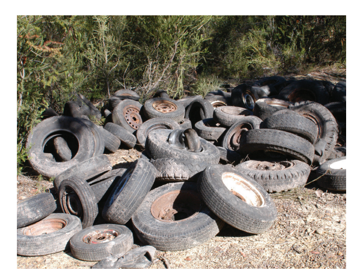
Fig. 6. Tyres dumped along the Warrah Trig track in very close proximity to roadside Astrotricha crassifolia subpopulations (Photo D. Beckers).

The Waratah Patch is a very popular area to view Waratahs ( Telopea speciosissima ) and in peak Waratah flowering season, pedestrian tracks trample the vegetation. This has the potential to affect subpopulations Acras1 , Acras2 and Acras3 which co-occur with Waratahs (Appendix 1).