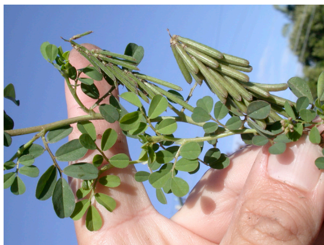
Fig. 6. Indigofera spicata is often found growing in lawns in Queensland and is now present in N.S.W.