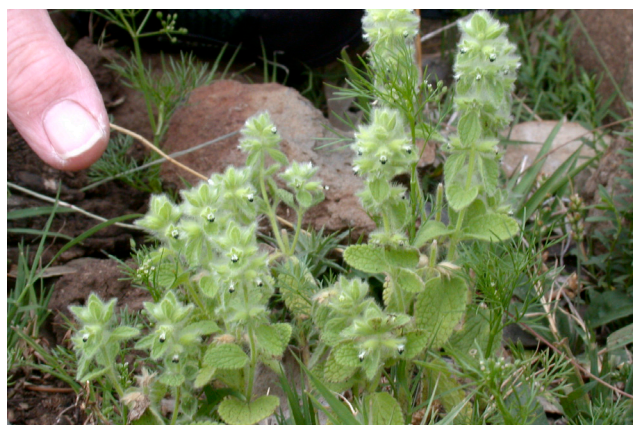
Fig. 8. Sideritis lanata is a weed that has been known to occur in the Inverell area for many years, but has only recently been identified.