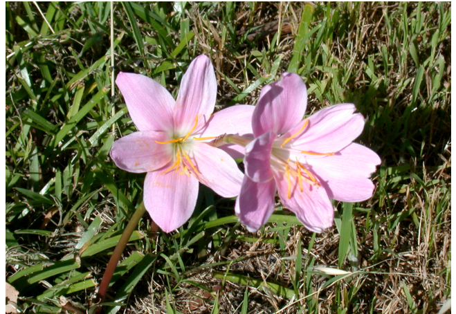
Fig. 1. Zephyranthes carinata growing on sandy soil in a mown area at Boat Harbour.

NOTES: Spread by seed. Hundreds of plants occurred in the collection area where they appeared to be spreading from cultivated plants. In its native range the species occurs in swamps and on lake margins (Mathew