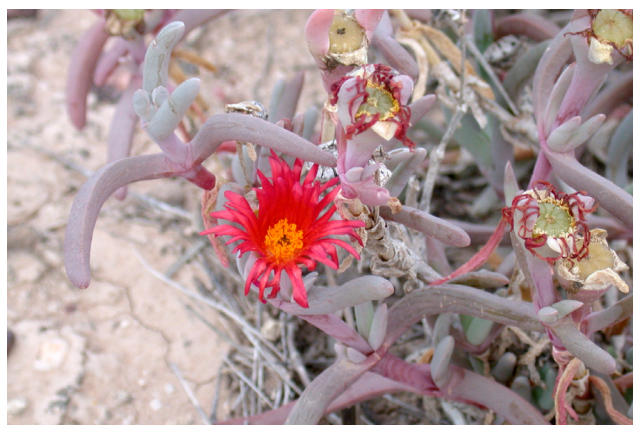
Fig. 4. Malephora crocea is a succulent that has naturalised in inland areas of N.S.W.

NOTES: Spread by seed. Although collected many years ago the identity of this species was only determined as part of the preparation of Asteraceae for the Flora of Australia series. The species has also been collected near Adelaide in South Australia (Thompson 2007). Thompson (2007) did not consider the species to be naturalised. The