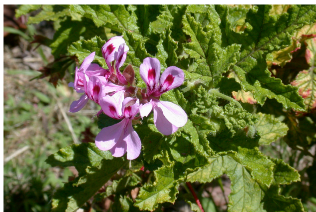
Fig. 7. Pelargonium quercifolium has oak-like leaves and has naturalised on sandy soils near the coast.

NOTES: Plants appear to spread via rooting of layering stems and from garden waste dumped in wet areas. This species is unlikely to be much of a problem as the species has been in cultivation for years and has not caused significant problems. There are many cultivars of