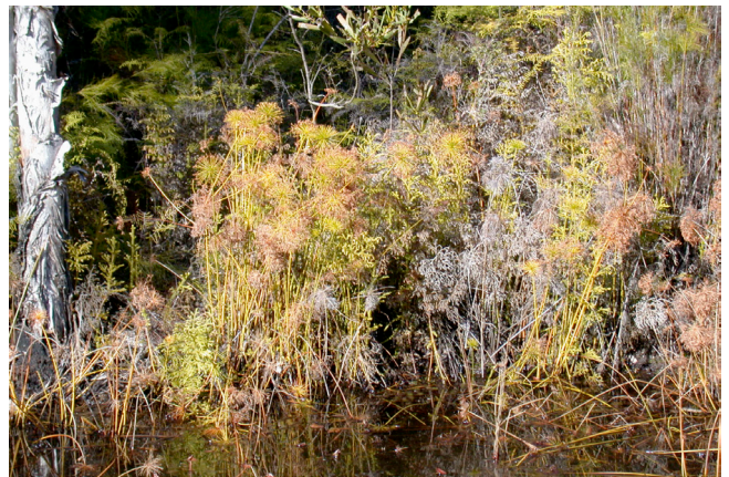
Fig. 2. Cyperus proliifer growing in a Melaleuca swamp at Salamander Bay.