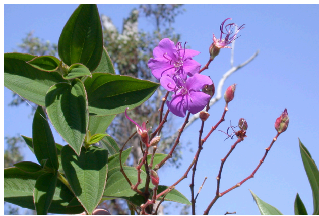
Fig. 9. Tibouchina urvilleana naturalises in swampy sandy areas in N.S.W.