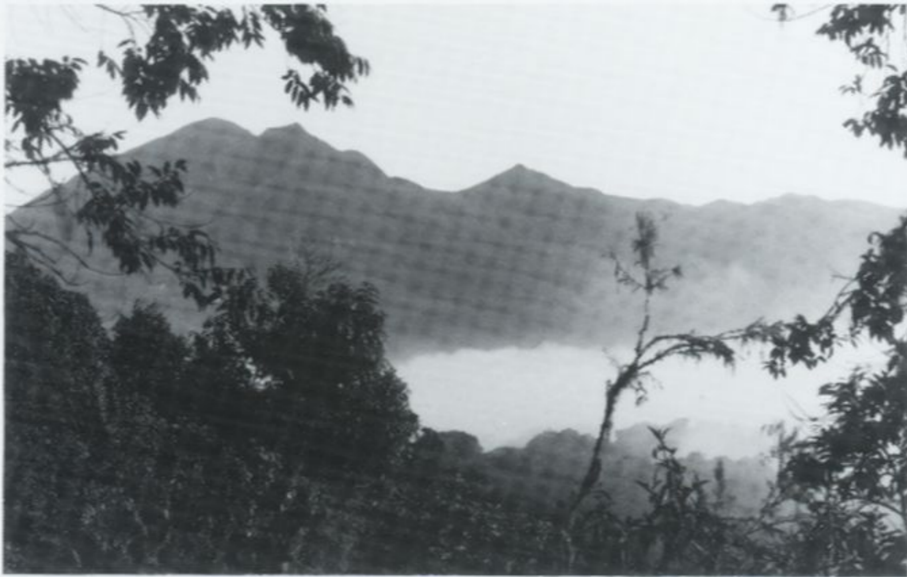
Fig. 3: Mt. Kahuzi seen from South, collecting sites 144-150. Phot. Pócs.