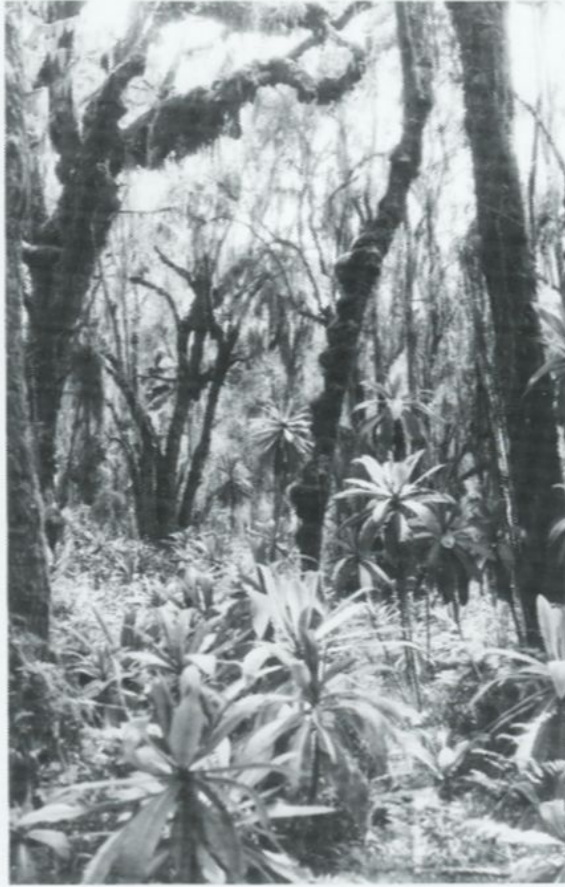
Fig. 5: Hagenia-Hypericum forest with mossballs at Mt. Karisimbi, locality no. 159.