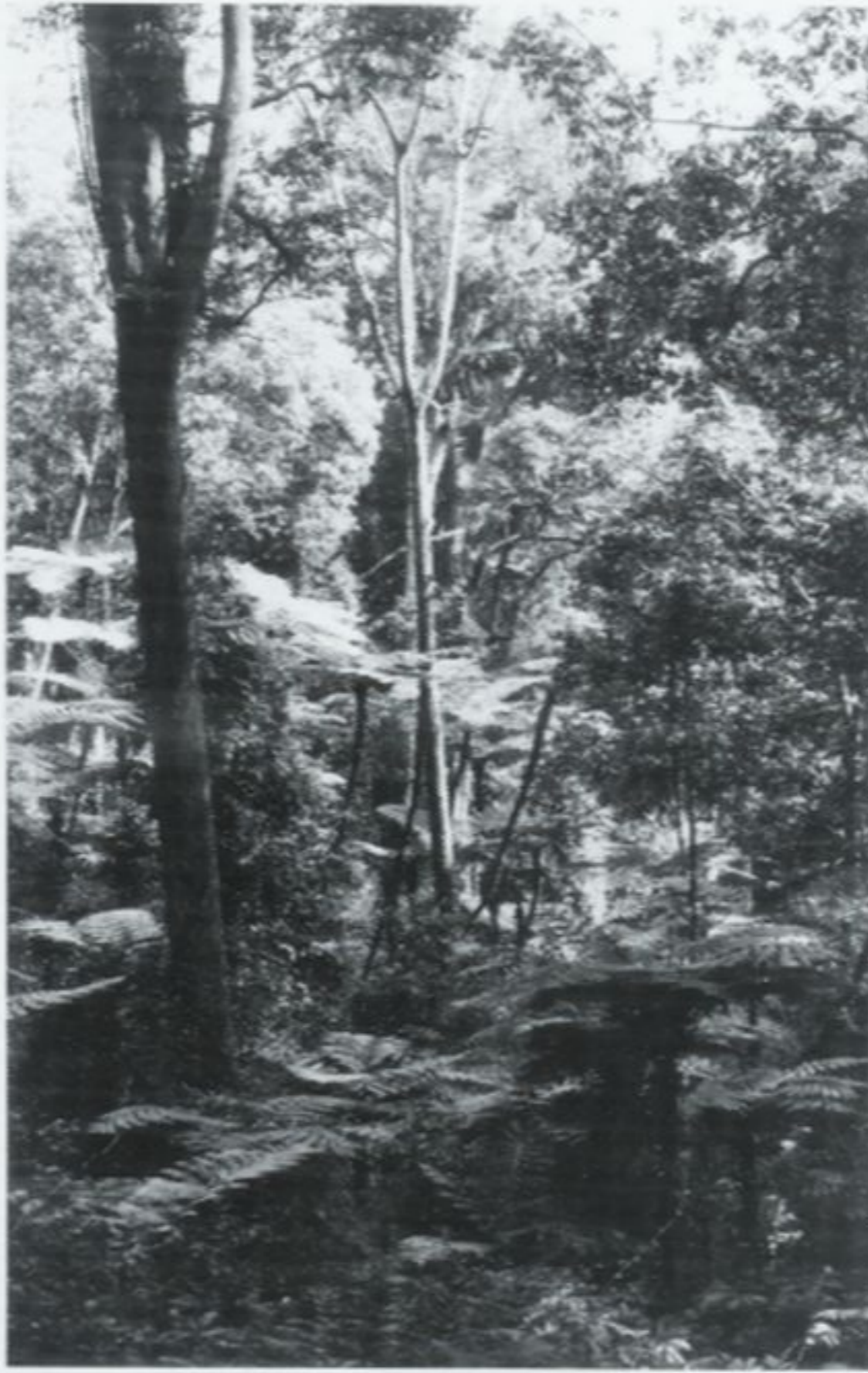
Fig. 4: Interior of Nyungwe forest, locality number 113.