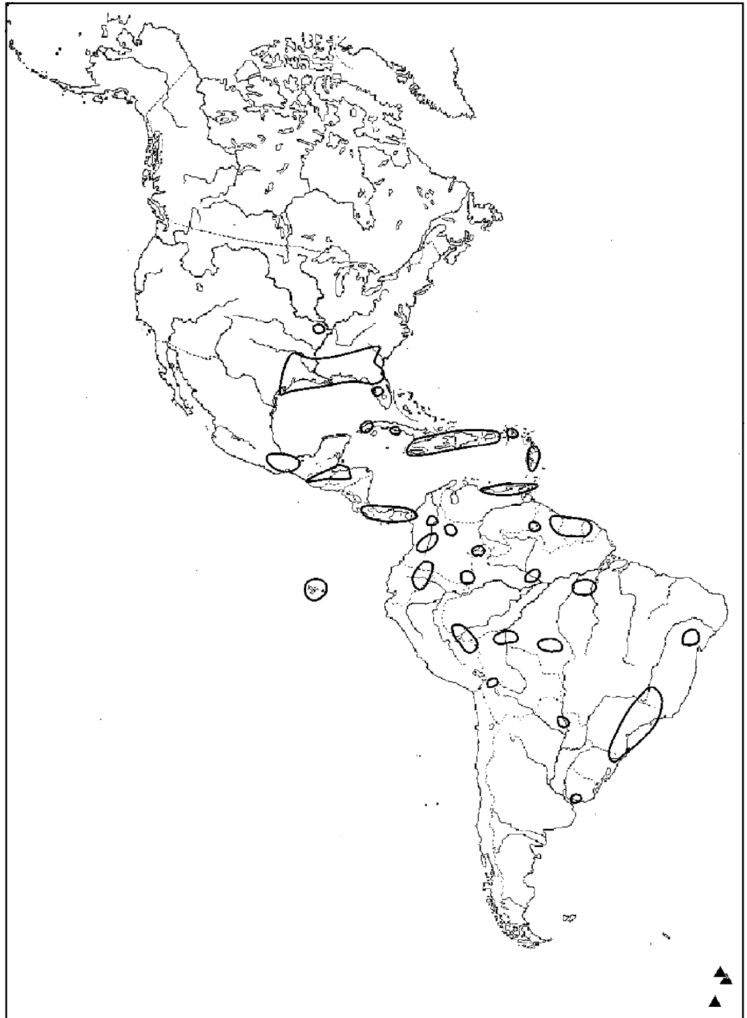
Fig. 2: Global geographical distribution of Dicranella hilariana (Mont.) Mitt.