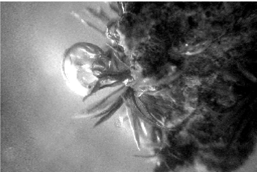
Fig. 2: Hypnodontopsis confertus (#20)