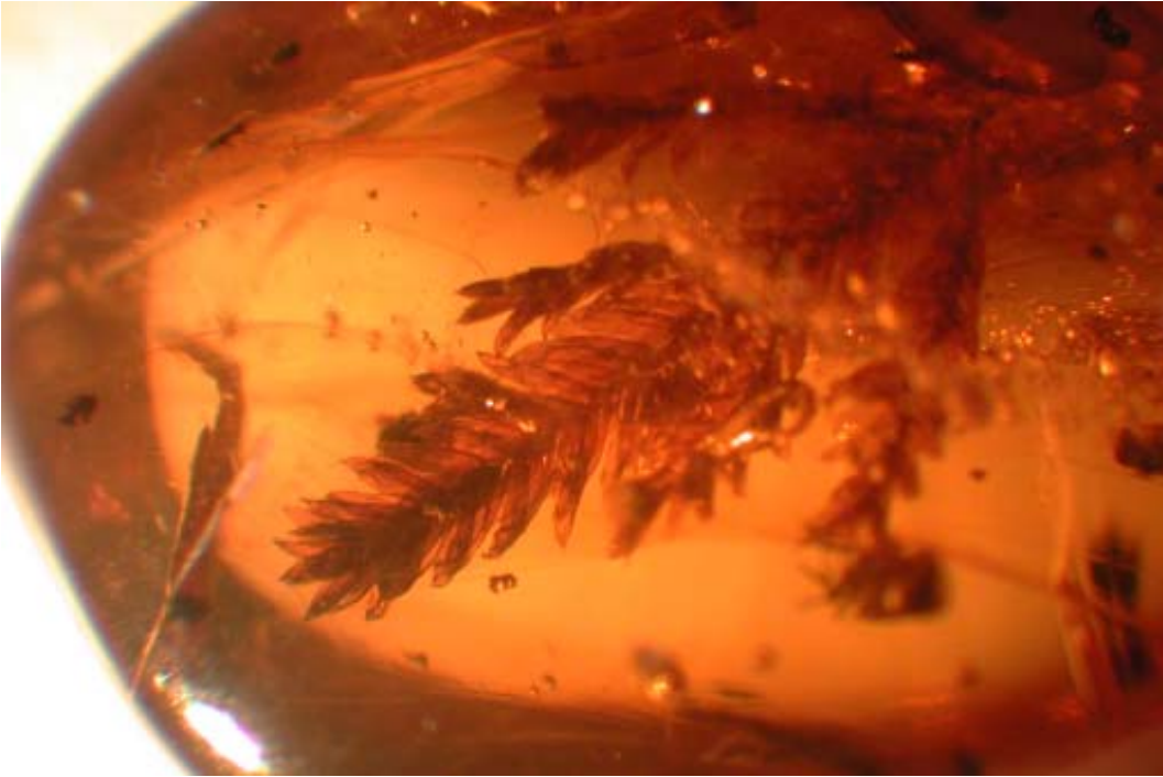
Fig. 1: Calyptothecium duplicatum (Velten 3)