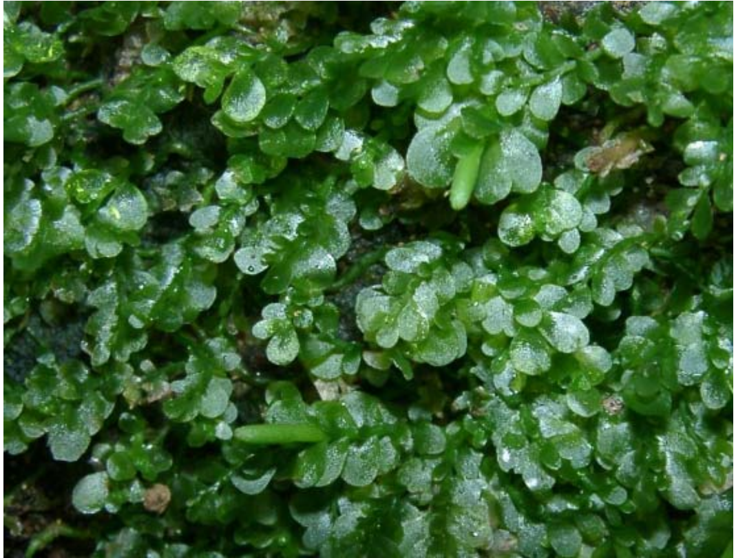
Fig. 3. Haplomitrium mnioides on moist rocks, Bawangling Nature Reserve, Hainan, China.