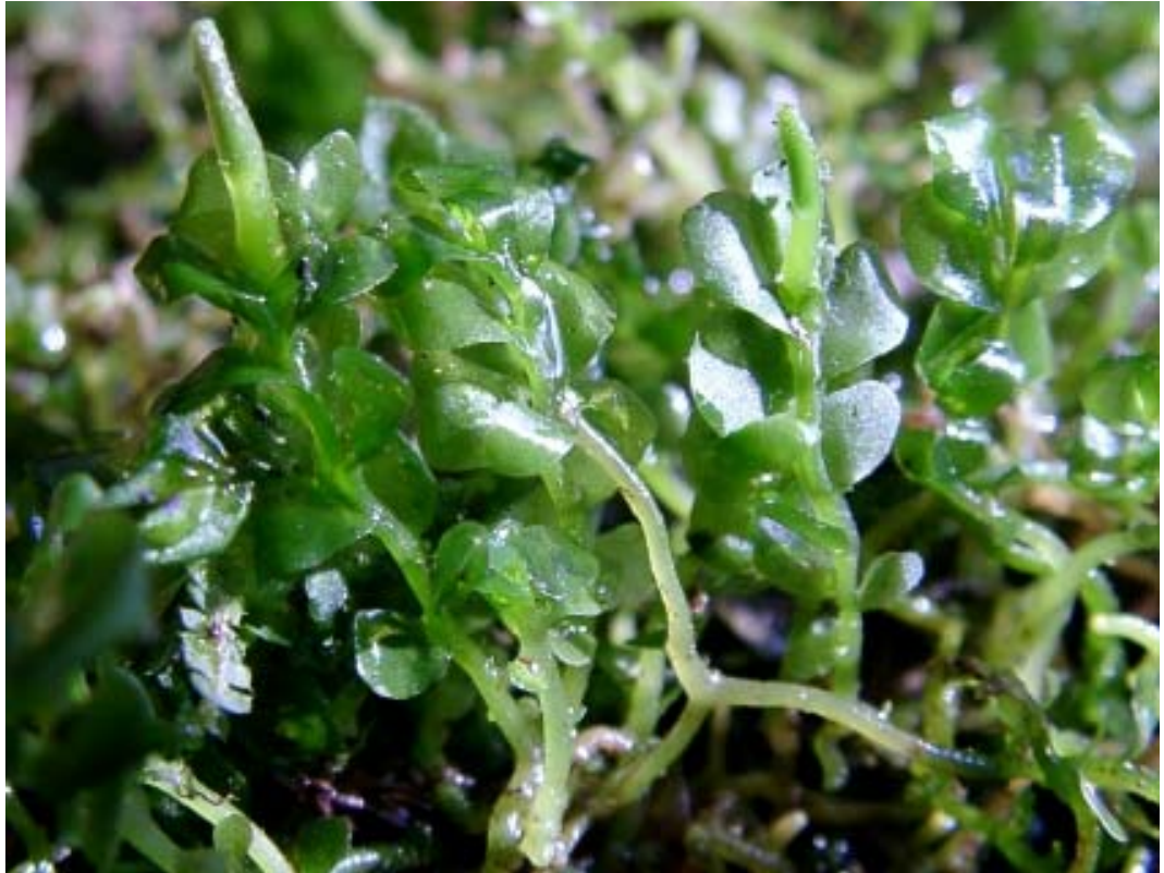
Fig. 1. Plants of Haplomitrium mnioides .

indicating its continuous distribution from west (Thailand) to east (Japan) (Fig. 2).